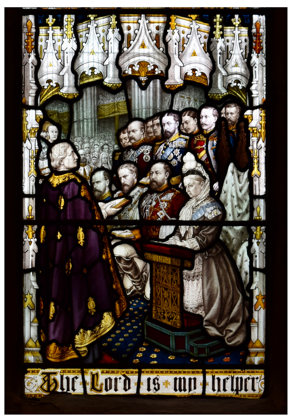
Fig. 4: T. W. Camm for Winfield and Co., detail of jubilee panel, north aisle window, Great Malvern Priory, 1887.