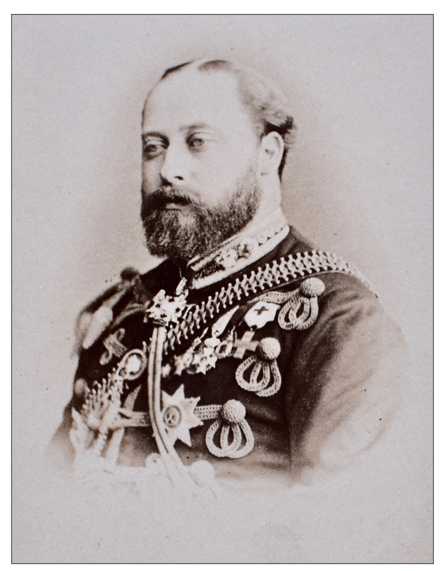
Fig. 5: Carte de visite portrait of the Prince of Wales, late nineteenth-century print after an original by W. & D. Downey of c. 1887. Private collection.

The window had to be modern enough to be distinguished from the Gothic Revival style but traditional enough to retain scholarly and reverential credentials. The urge to be both 'modern' and 'worldly' while retaining 'religious feeling' and an 'ecclesiastical tone' points towards Camm's attempts to integrate photographic imagery within the medievalist medium, one of the most distinctive features of the window and a subject worth considering in detail.