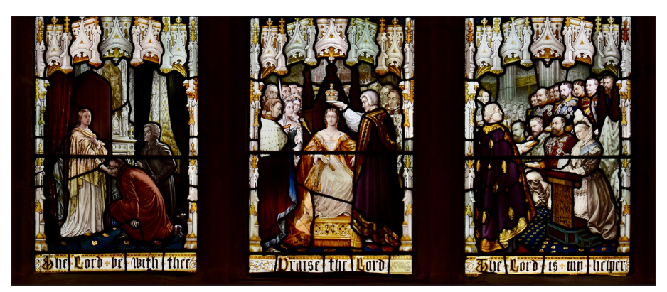
Fig. 3: T. W. Camm for Winfield and Co., detail of lower panels, north aisle window, Great Malvern Priory, 1887.

(1800–1869). By the 1880s, Atkins owned a residence in Great Malvern, but was still head of a firm deeply embedded in the manufacturing culture of Birmingham.<sup>5</sup>