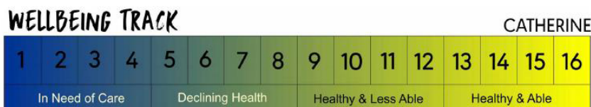
Figure 2. Wellbeing track for people in Hoptown.