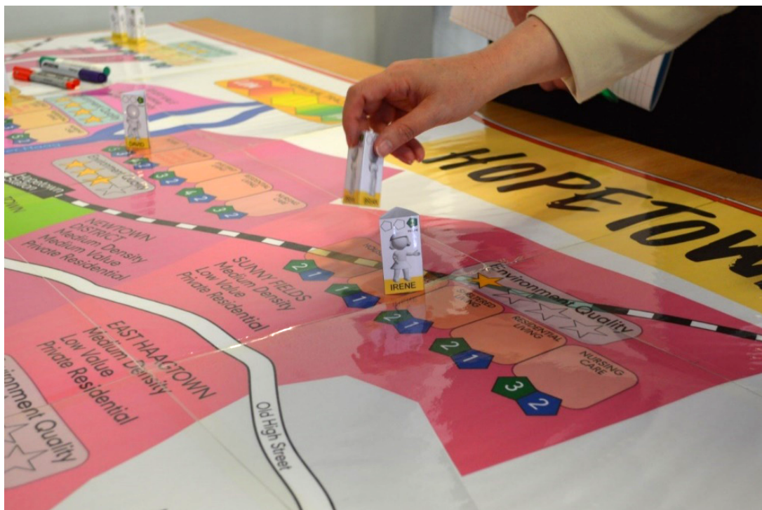
Figure 3. An example of a counter on the board representing a fictional character, Irene.

Each group had a designated facilitator, as well as a note taker drawn from the research team whose task it was to document the process through observational field notes.