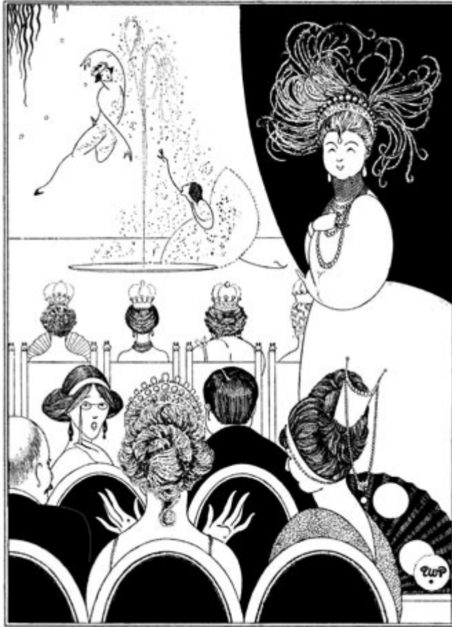
Climbers. The Perpendicular