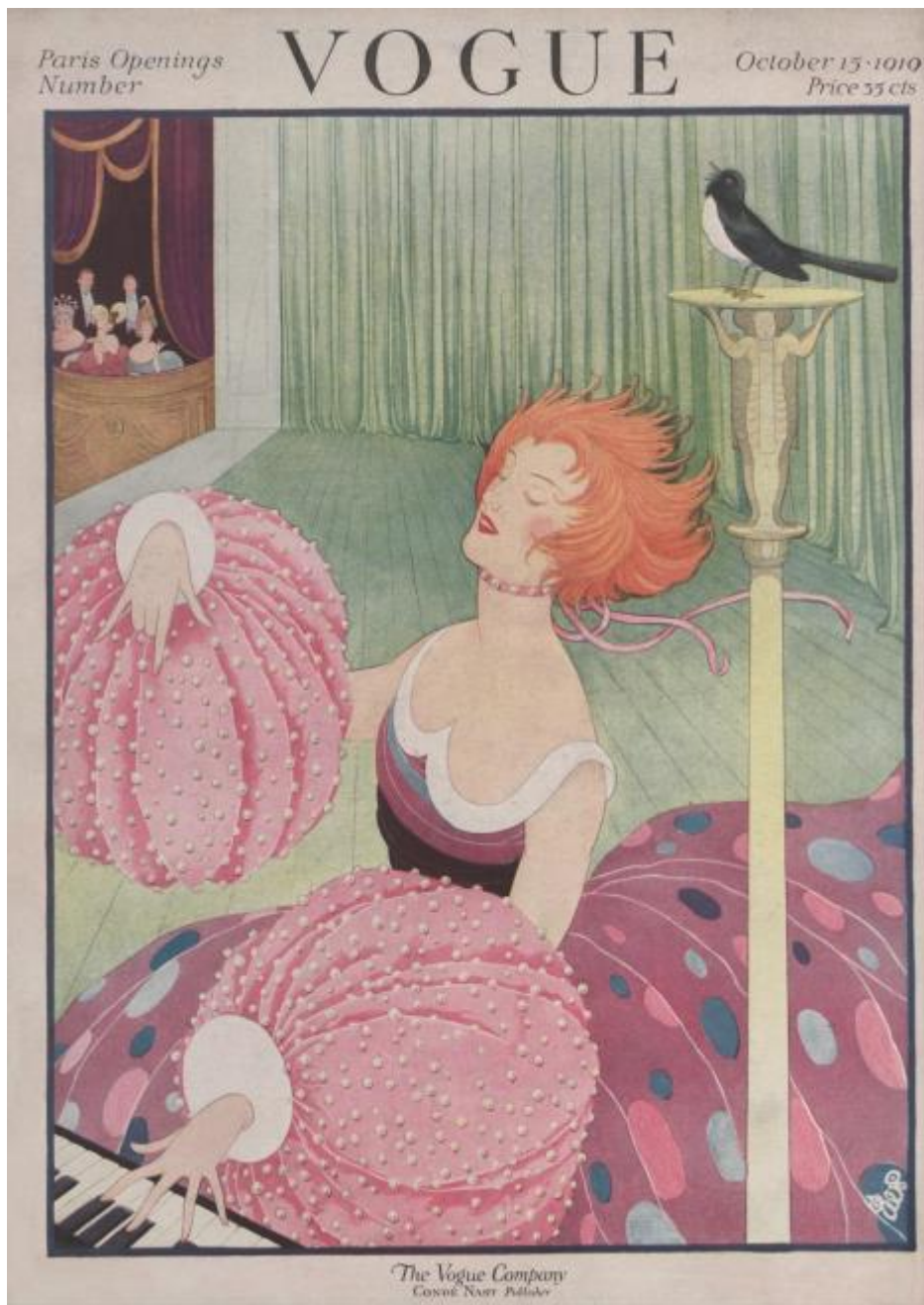
Figure 3. George Wolfe Plank, Vogue (American edition) 55, no. 8, October 15, 1919: cover.