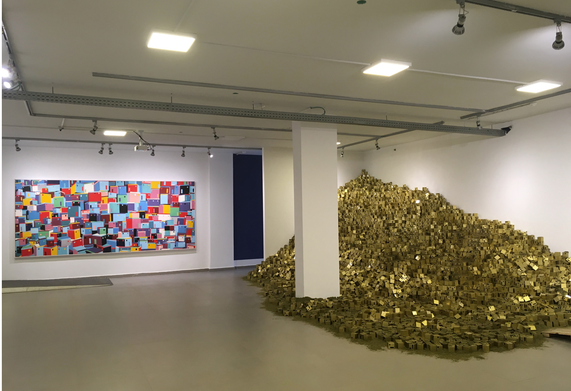
'Preoccupation', 2018, oil on canvas (left) and 'Shift', 2018, tin and za'atar (right)