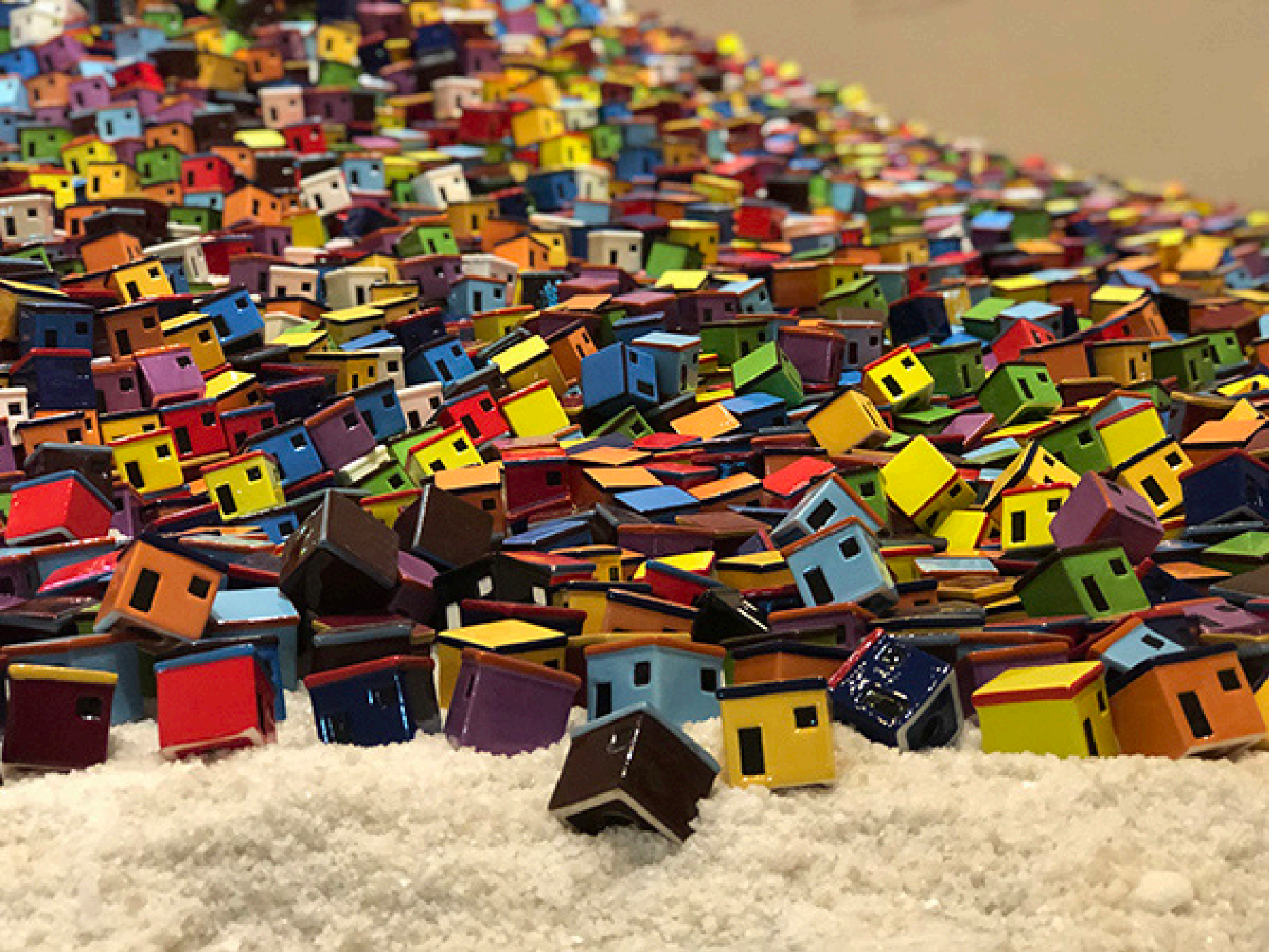
'Fata Morgana', A Stitch in Time exhibition, Beijing