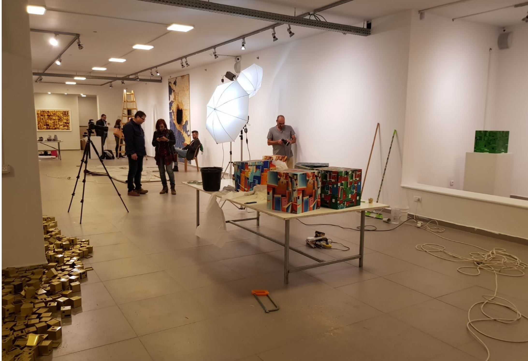
Installation of The Punishment of Luxury exhibition