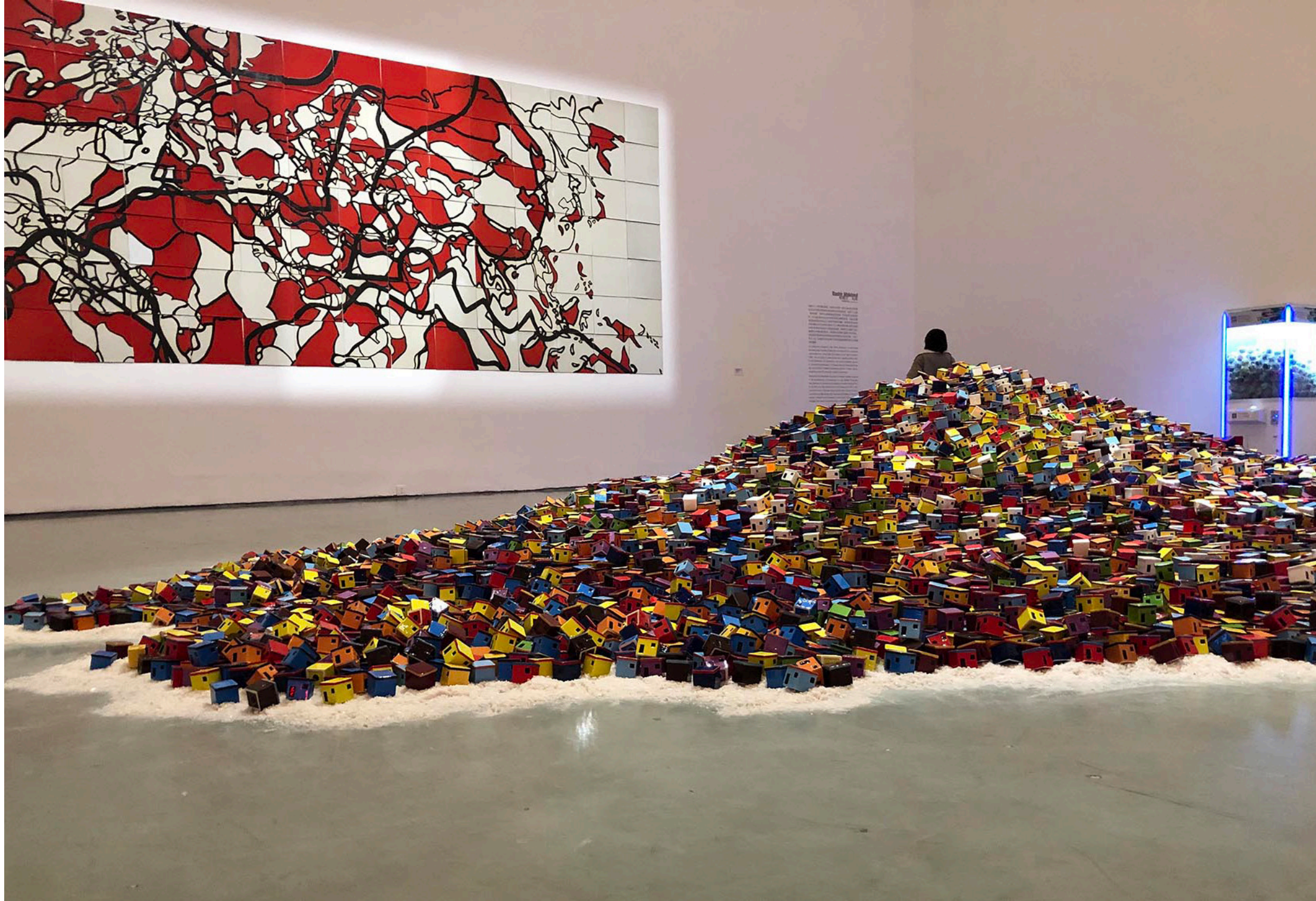
'Fata Morgana', A Stitch in Time exhibition, Beijing