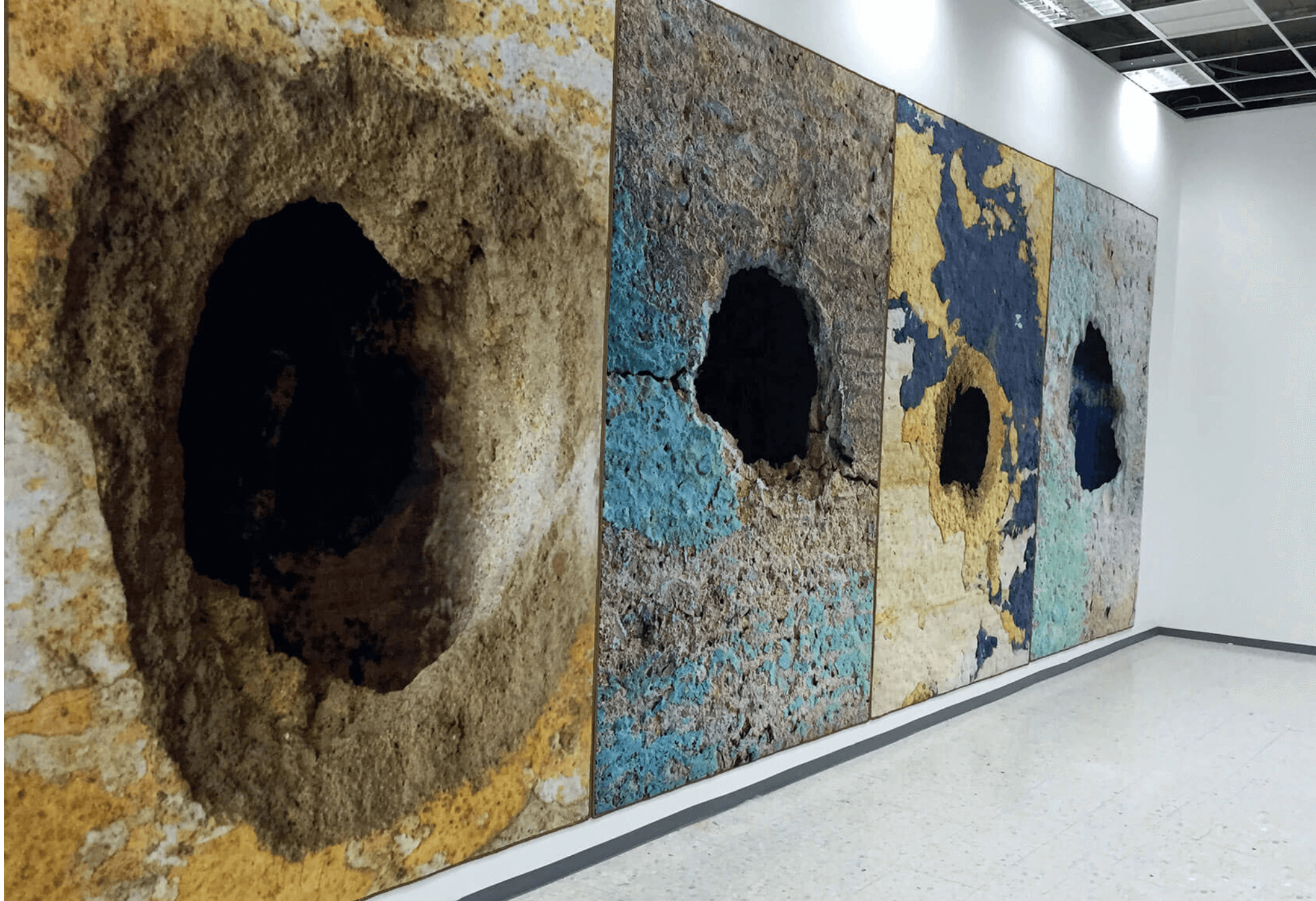
'Points of View', 2015, printed tapestry