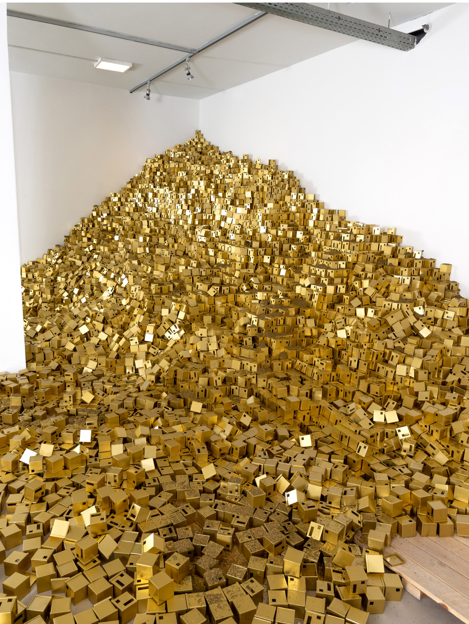
'Shift', 2018, tin and za'atar