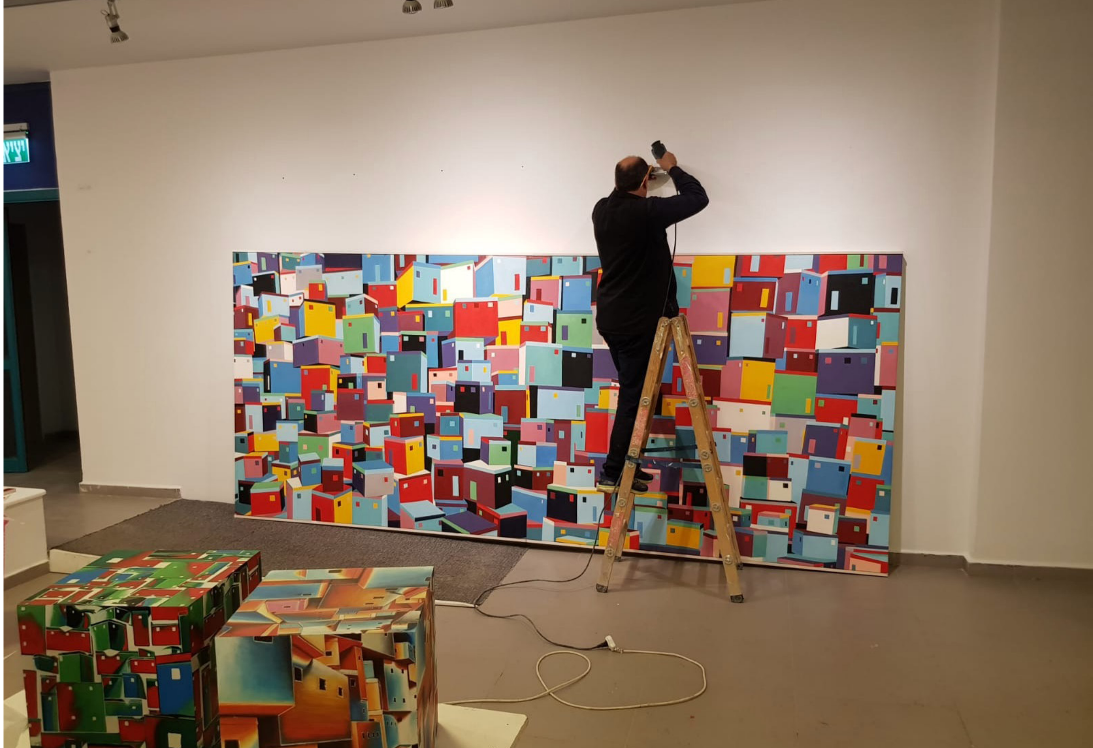
Installation of The Punishment of Luxury exhibition