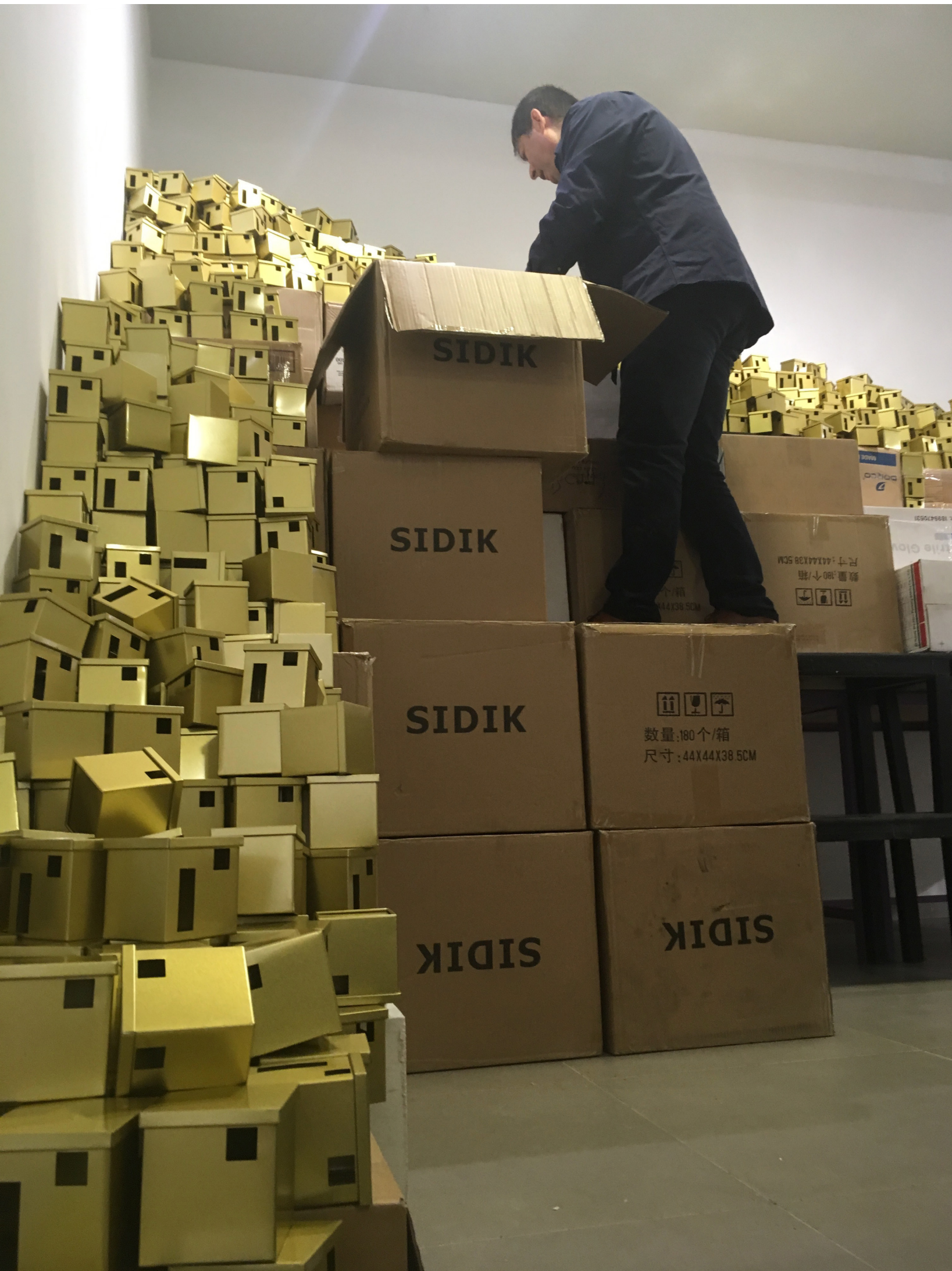
Installation of The Punishment of Luxury exhibition