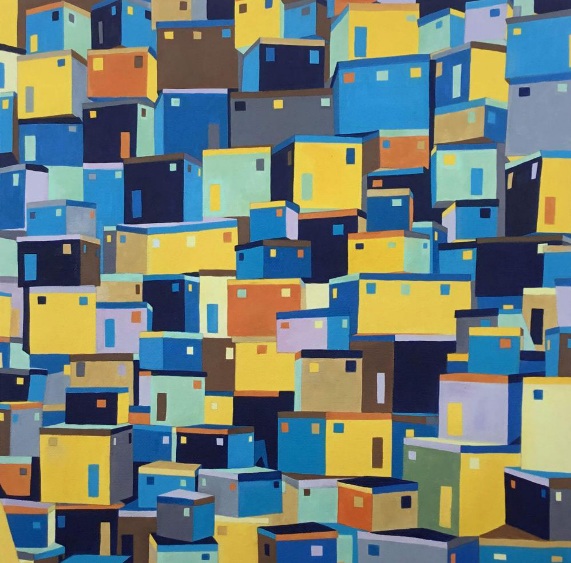
'Preoccupation 2', 2018, oil on canvas