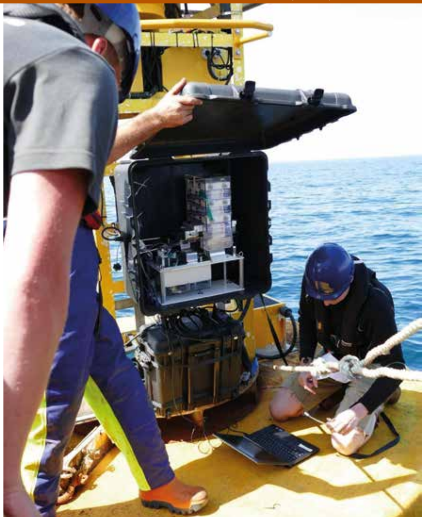
Fig. 1. MAPS Marine Autonomous Plankton Sampler on the long-term buoy L4 of the Western Channel Observatory, English Channel.