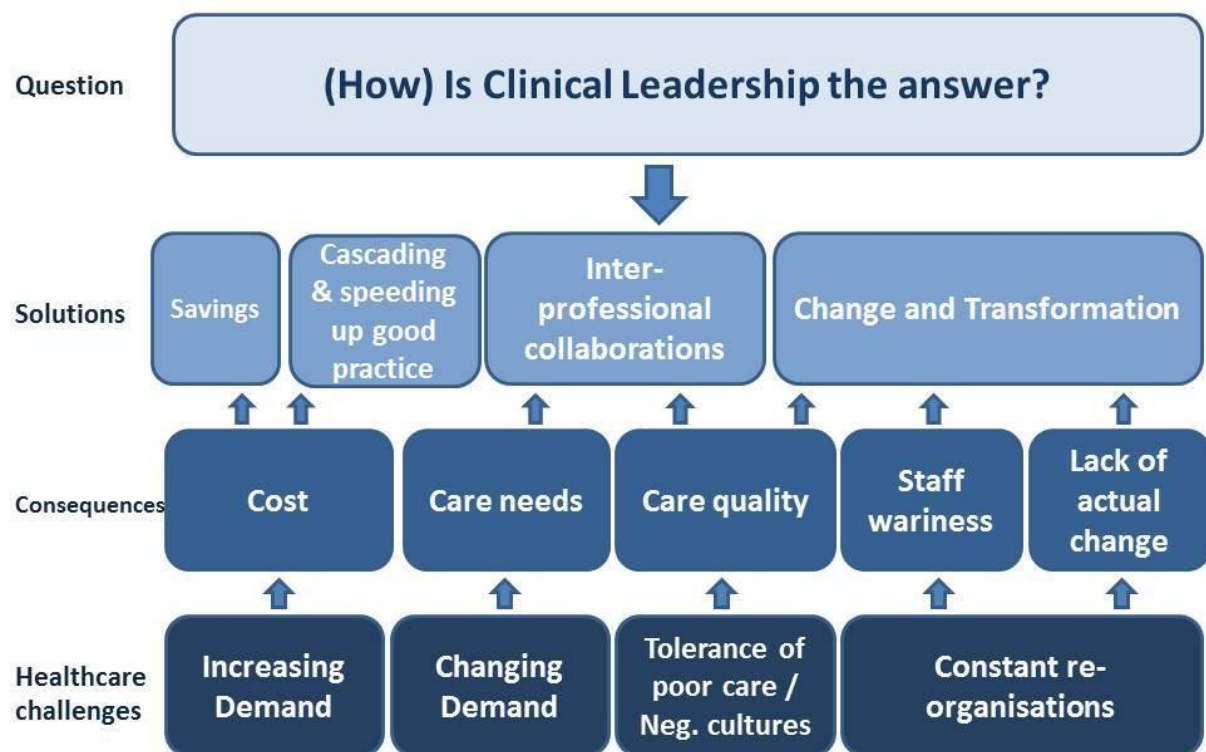
Figure 1 Results of the policy analysis on the assumed relationship of clinical leadership to healthcare challenges

Figure 1 presents the findings of the policy document analysis. It shows that the key challenges involve increasing and changing demand, particularly in terms of an aging population and increasing multi-morbidities; negative cultures within healthcare, including a tolerance of poor care demonstrated in repeated care crises; and challenges brought on by repeated re-organisations of practice over the last decade. The analysis shows that the consequences of these challenges entail increasing costs, complex care needs, care quality issues, staff wariness and absence of genuine change. Across the documents, the following are seen as necessary solutions: increasing inter-professional collaboration, speeding up the scaling up of good practice and genuine change and transformation of practice, instead of further organisational re-structuring.