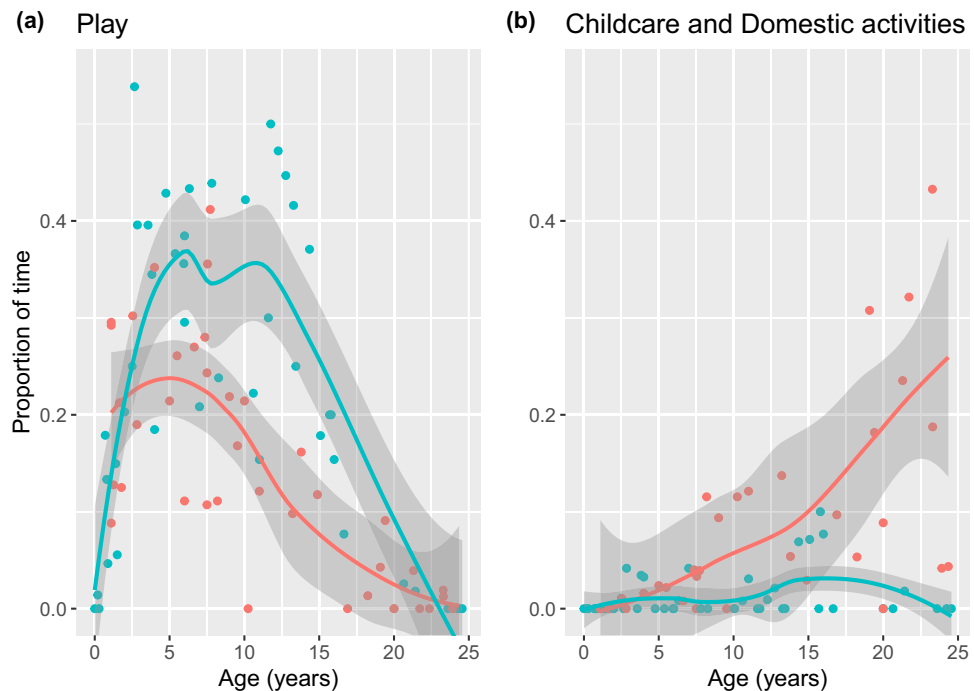
Figure 3. Scatterplot of proportion of in-camp time spent at (a) play and (b) childcare and domestic activities by age (years). Red denotes females, blue denotes males. Curves fitted using loess. Shaded areas represent 95% confidence interval. N: male = 45, female = 40. Note that individuals with less than 10 scan observations were excluded.