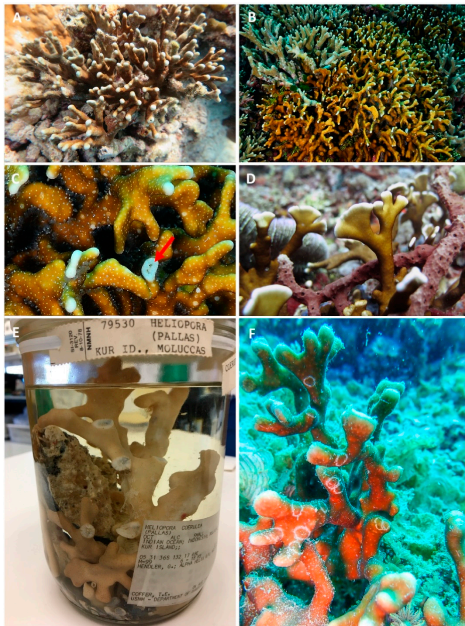
Figure 1. New photographic evidence increases the known distribution of Heliopora hiberniana . (A). Kunfunadhoo Island, Baa Atoll, Maldives, 12 m; (B,C). Wangiwangi Island, Wakatobi Islands, Indonesia, 10–12 m. The red arrow points to a broken branch showing the white skeleton; (D). Gili Islands, Indonesia, 8 m; (E). Specimen #79530 Smithsonian Institute. Collected by Gordon Hendler on the Helix-79 expedition in 1979, station M-99, Kur Island, Moluccas, 8–16 m; (F). Gili Islands, 10 m with annular lesions.

Colonies at the Gili Islands in Indonesia were commonly observed to have white rings with healthy, intact tissue in the centre (Figure 1G). The rings are presumed to be a feeding scar because similar annular lesions observed on Acropora palmata in the Atlantic Ocean, and Psammocora albopicta in South Korea, were formed by the foraging activity of cowfish (Ostraciidae) [11,12]. Further observational studies are needed to determine if a member of the Ostraciidae family is responsible for the Heliopora lesions. These new records advance our understanding of the distribution of this species, but little information is available about its reproductive behaviour or symbiont composition. Further demographic data, along with experimental and post-bleaching survivorship studies are needed to test the hypothesis