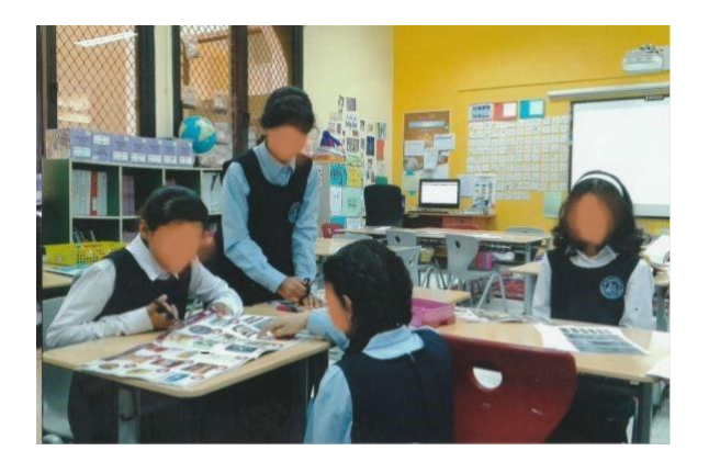
Figure 4.2<sup>9</sup> Language Barrier Codification

Through the careful use of questioning that challenged any rigid stance, I was able to elicit other possibilities from the student's initial interpretation and, in some cases, the alternatives changed the status of the characters depicted in the codification. In this excerpt, students in L3 are discussing the 'Language Barrier' codification and trying to determine why one student is noticeably disengaged from the task.