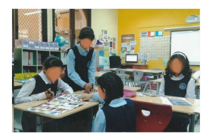
Figure 4.3 Language Barrier

Observational notes taken from the L3 video recording for this lesson report: