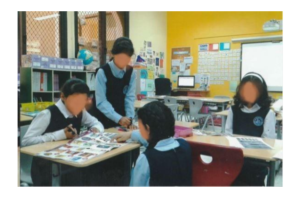
Figure 3.4<sup>4</sup> Codification 4 'Language Barrier'

The codification Language Barrier (Figure 5) depicts a maths lesson familiar to the students. To the left, three students are busily cutting coupons out of a supermarket flyer. These students are on task, helping each other and contributing to the shared goal of completing their task. To the right, one student sits apart from the others, head down and silent. She is not doing anything observable and it is this that sets her apart from the others. This codification instigated discussion around friendship, communication, language barriers and awareness of others.