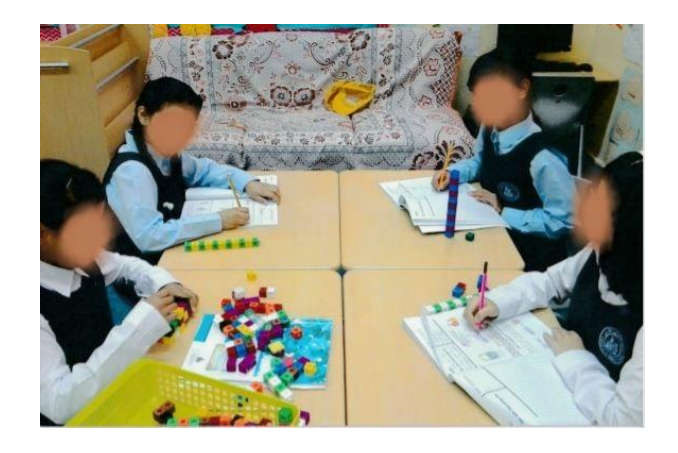
Figure 4.1 'Work or Play' Critical Pedagogy Codification

book. In establishing the initial scene through the open question of 'what do you see', the topic of work is quickly elicited from the students.