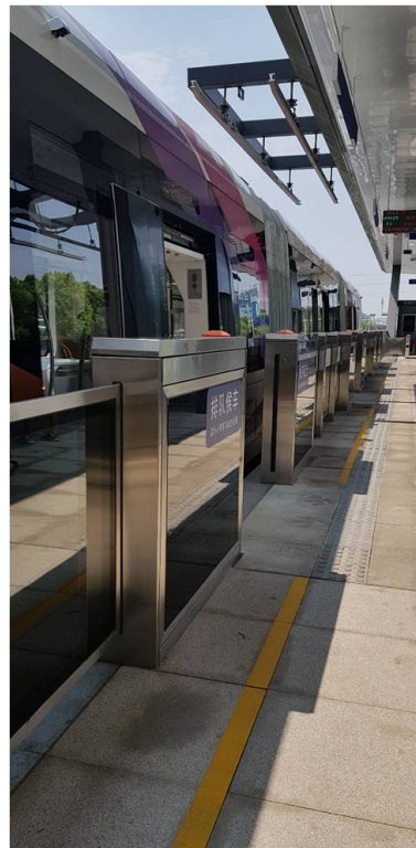
Figure 3. Trackless tram system station.