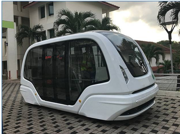
Figure 6. Trial Autonomous Shuttle on Nanyang Technological University campus in Singapore.

dependence while offering greater accessibility. However, there is one more major attraction of the Trackless Tram System that stands to provide a powerful drive for urban renewal and development. This is the city-shaping potential which is illustrated through two case studies in the following part.