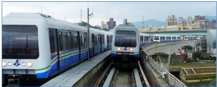
Figure 2. Taipei metro line 1—Wenhu line.