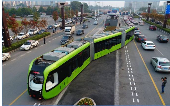
Figure 1. The Trackless Tram System developed by CRRC and demonstrated in Zhuzhou, China.

Three of the authors of this paper were able to visit China in August 2018 and ride the Trackless Tram as well as receive detailed explanations about how it works and how the transit system is constructed and operated. The paper is therefore based on this transit technology though it is not excluding other manufacturers such as Alstom, Van Hool, Irizar, and others. The technology was first taken to scale in China in 2016 on a straight 3.6 km line with 4 stations. Based on findings from the study tour to Zhuzhou, China it is the intention of this paper to not only demonstrate that the Trackless Tram is a superior technology for many corridor connections in urban transit systems but to explore the notion that it is potentially the public transport catalyst that many city planners have been waiting for since the dominance of automobile dependence, as it can unlock urban regeneration. It is the conclusion of this paper that not only is this technology a potential game changer for cities struggling to attract investment in traditional light rail projects, if implemented through an entrepreneurial approach in collaboration with the private sector it stands to unlock significant urban re-development options.