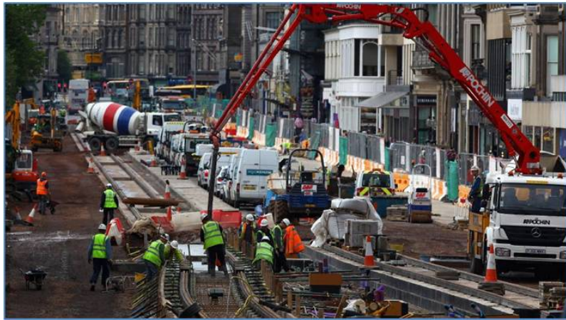
Figure 4. Construction of the Edinburgh tram project.

that may occur, fitting this data to the information sourced from the other guidance technologies to create an overall sense of the surrounding environment.