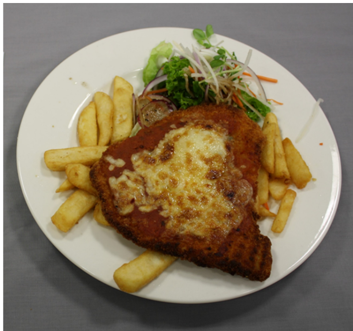
Figure 1. Example of image shown to participants where they were asked what advice they would give this person to help them lose weight.

For example, “people in this study will use an app on their phone to take pictures of their food and drink. Imagine we received this picture from a man wanting to lose weight, what advice should we give him?” (Figure 1). Participants, who were interviewed on the phone, were emailed this information and the images in advance.