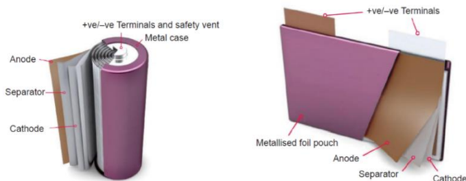
Figure 2: Lithium-Ion Battery Composition

consists of tens to thousands of individual cells packaged together to provide the required voltage, power and energy [1].