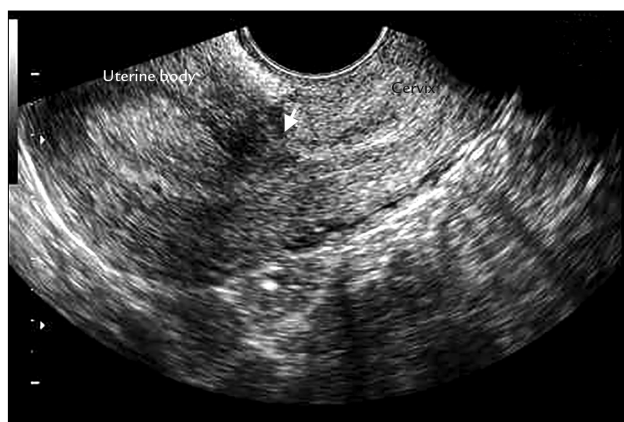
FIGURE 3 Transvaginal ultrasonography after 3 months of drug treatment with local and systemic methotrexate for cesarean scar ectopic pregnancy.

peated when \beta -hCG reaches a negative value or after 3 months of drug treatment. This should only be brought forward if there are new episodes of bleeding.