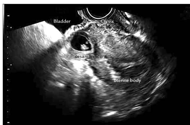
FIGURE 1 Ultrasonography showing the anatomical relationship between bladder, cervix, uterine body and gestational sac in the topography of the cesarean scar, with an empty uterine cavity.

Due to the presence of the live embryo, the patient was submitted to transvaginal ultrasound-guided puncture and injection of methotrexate inside the gestational sac at 68 mg (1 mg/kg). A 17 Gauge Cook® Medical