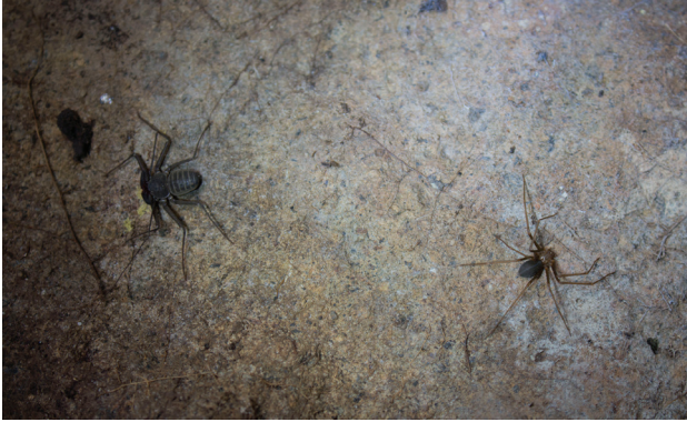
Figure 3. The whip spider Charinus asturius (left side, carapace length ~ 4 mm) and a recluse spider Loxosceles sp. (right side) sharing the undersurface of a rock.

We found a female biased Adult Sex Ratio (ASR) in our samples close to 4:1. Twenty-nine of the individuals found were females, seven were males and 26 were juveniles. Among them, some individuals were found under the same rock. In five different times a female was found with a juvenile; we once found a female with two juveniles and a male with two juveniles.