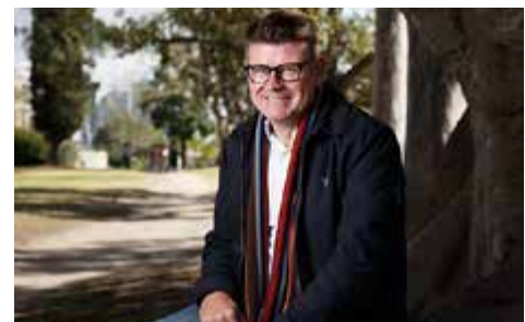
Lived experience: Breaking free