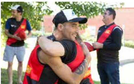
Greater than the sum of our parts

See Inside gambling for the latest information, evidence and expert opinion on gambling issues in Australia and overseas.