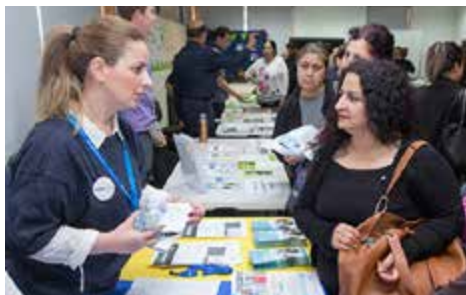
Gambling Harm Awareness Week 2018