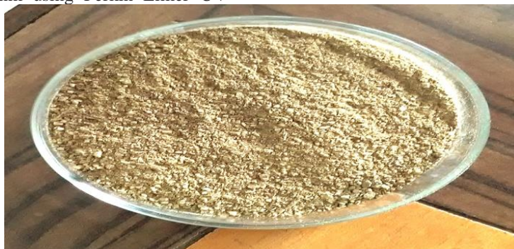
Fig 1: Ayurvedic churna is prepared by using different process in which we firstly grind the crude material in fine powder by using electrical grinder. These materials grind in to fine powder individually, after that dries these powdered drugs in sun light for few hours. After the proper drying mixed the all powdered drug according to required amount or according to given formula

spectrophotometer. Churna is a powdered dosage form which has a specific therapeutic effect. Generally we used churna for the treatment of digested problems but it has many other pharmaceutical uses in our daily life.