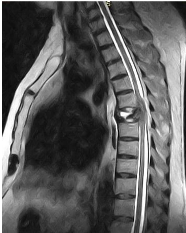
Fig. 1: Sagittal T2 MR Image of a 28 y male with involvement of D8 vertebra. The presenting signs were backache, lower limb weakness and sphincter dysfunction.

We observed postoperative worsening of neurological function in 3 (9.7%). Two of the patients progressed from 4/5 power in the lower limbs to 1/5. All of these patients recovered their function to 3/5 at the end of 1 st month postoperatively, but never improved to complete neurological function. One patient remained static in terms of neurological recovery despite adequate decompression and