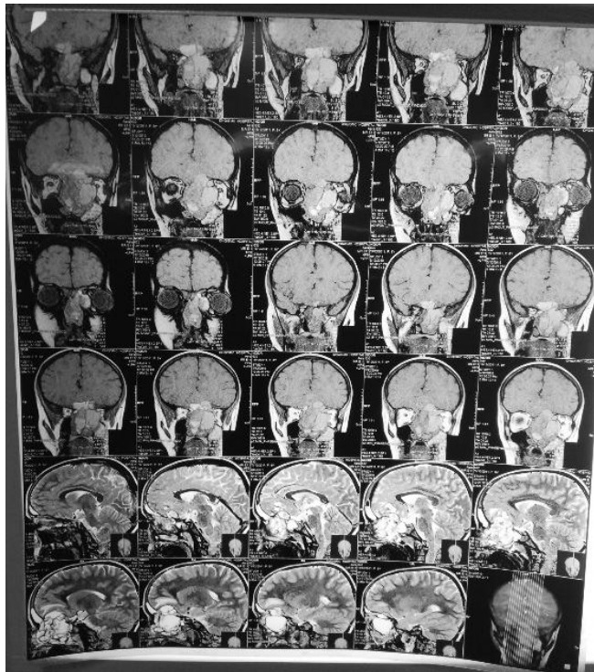
Fig. 1: MRI T1W and T2W in Sagittal and Coronal Sections.

extending into the left infratemporal fossa, and caused erosion of left lamina papyracea with left infraorbital extension. Posteriorly, it was extended up to Basisphenoid.