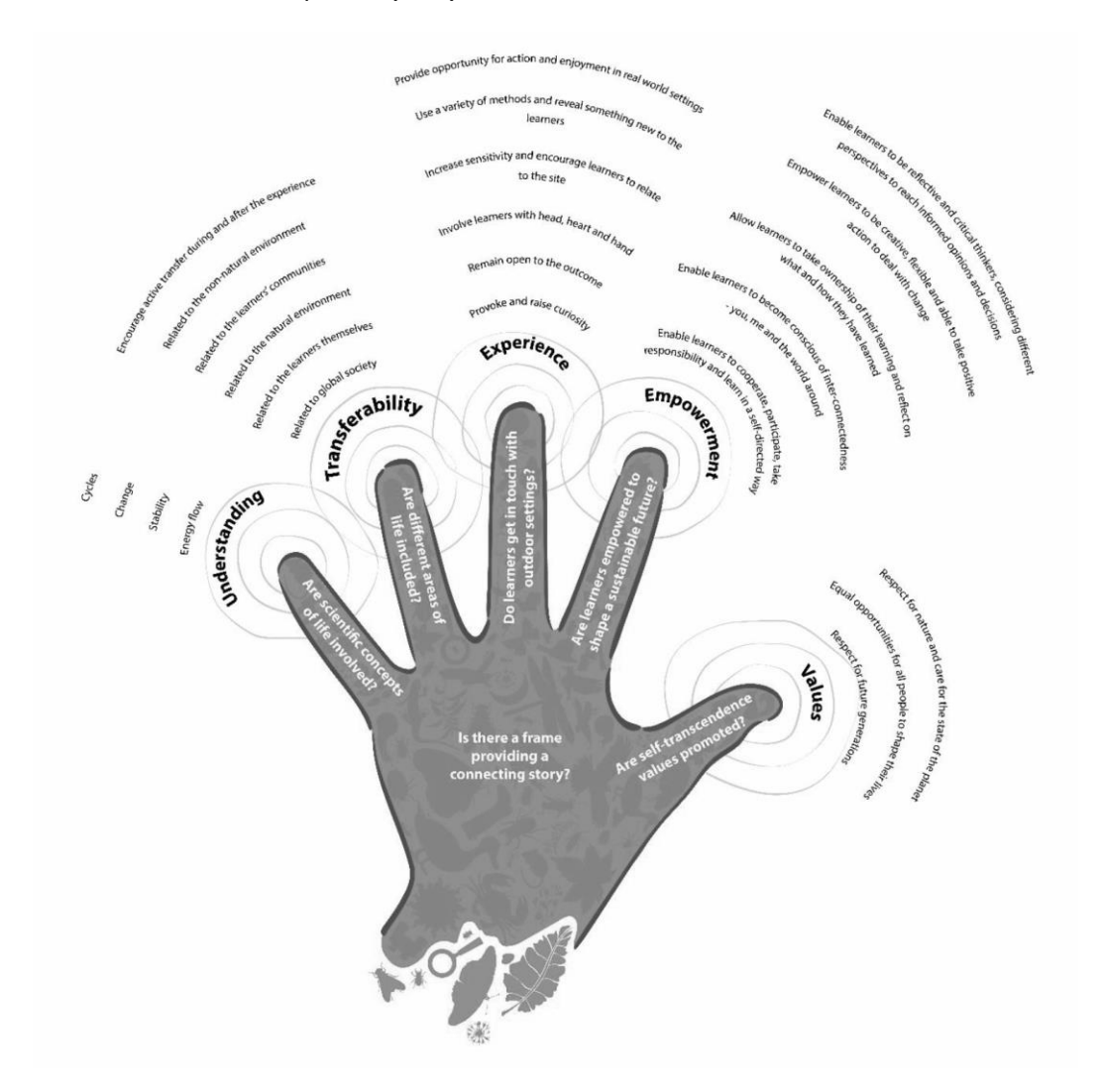
Figure 1: RWL 'Hand Model'

As the UN Decade for Education for Sustainable Development (2005 – 2014) drew to a close, outdoor educators from across Europe came together in 2011 to form the Real World Learning Network (RWLn). The network set out to explore elements that contribute to deep and meaningful outdoor learning experiences which support sustainable thinking and action, embedded within sustainability education (RWLn, 2015). After three years of collaborative work, the RWLn launched the Hand Model; providing guidance for outdoor learning for sustainability (OLfS). OLfS is based on the use of the term in the Scottish education context. It is used to incorporate outdoor learning, education for sustainable development, children's rights, international and citizenship education (Scottish Government, 2014), and additionally draws from, and connects to, the wider fields of environmental education (EE) and Education for Sustainable Development (ESD).