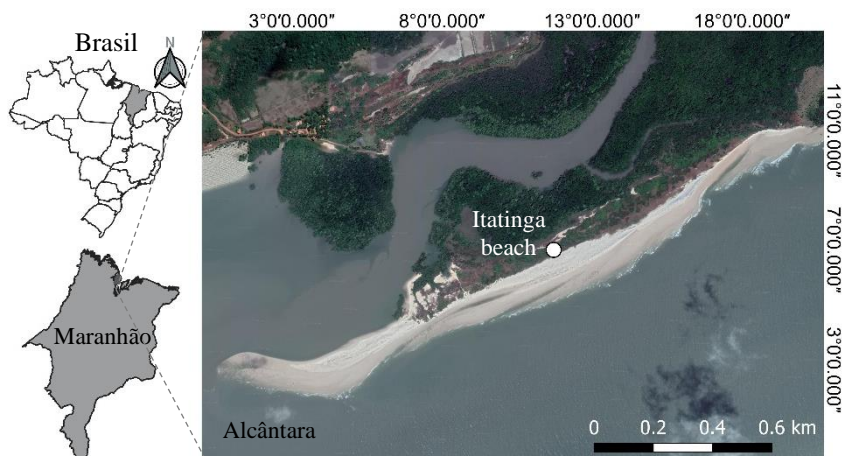
Figure 1. Restinga of Itatinga beach, Alcântara city, Maranhão State, Brazil.

According to the classification proposed by Santos-Filho, Almeida Jr., Soares & Zickel (2010), the restinga of Itatinga beach has three physiognomies: nonflooded fields, open nonflooded shrublands, and closed nonflooded shrublands. Phytosociological analysis was performed only on the closed nonflooded shrublands physiognomy, characterized by shrub-tree vegetation, comprising the woody component of the area.