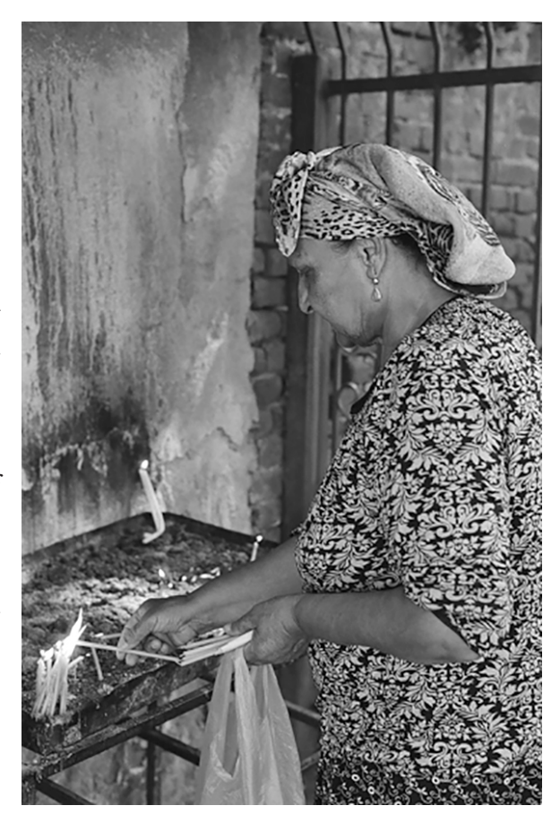
Lighting candles in the courtyard of St. Joseph's chapel.

The ritual circuit made inside the chapel with a sacrificial animal—a practice popular in Letnica and beyond—had been repeatedly criticized and finally forbidden, while the offering of the animal to the church as well as the practice of walking the animal around the building must be occasionally permitted by the clergy. Another popular practice observed in Letnica, the ritual of wrapping a thread around the building of a chapel, was banned several years ago. Wrapping a religious building or another ritual object with a thread is a common vernacular practice aimed