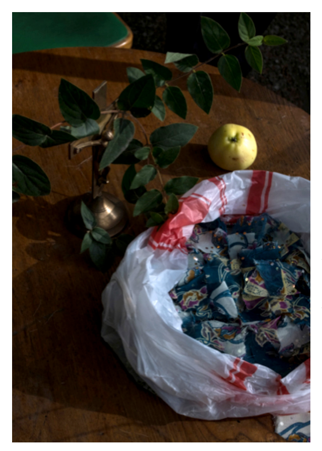
Tiny flaps of fabric.

As a rule, the clergy are present on the territory of the chapel throughout the two days when it is open for pilgrims. It is worth pointing that some of the lay assistants, who are engaged by the clergy and regularly help in organizing the pilgrimage, come from Roma Muslim community. The priests and helpers are involved in all initiatives: services and collective recitations of prayers, sharing flaps of the fabric and holy water, as well as in communication with visitors. The clergy give personal permission or restrict the performance of a certain devotional action if it seems to him ambiguous or contradicts the official position of the parish or personal attitude of a priest. It is important to note that some of the helpers, since they are members of the parishes belonging to this or neighboring