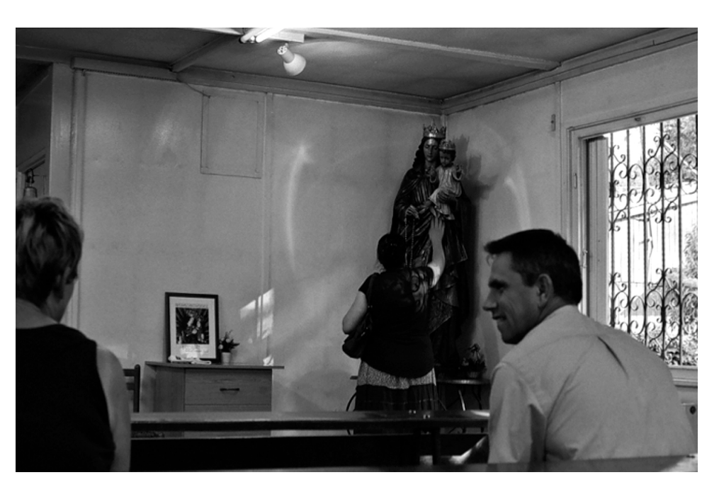
"May the Virgin of Letnica grace him health!" Photo by Ksenia Trofimova, 2017.

that convey symbolic meaning."<sup>49</sup> Following this approach, the space of pilgrimage may be represented as mediated by variable ritual actions, pragmatics, and interpretations, shared by both lay believers and the clergy. The image of the holy place that frames the pilgrimage is created and transmitted via open sources: mainly, via oral accounts, journalistic reporting, notes from diocesan media, sermons or public comments made by religious authorities.