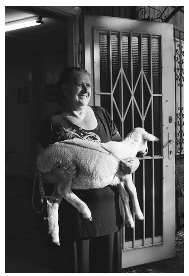
Offering a sacrifical animal (lamb) at the chapel doors.

at overcoming problems associated with childbearing and fertility.<sup>61</sup> Even though the belt woven from the threads was defined in one of the church reports from the 1970s as a "holy" belt of "fertility," <sup>62</sup> the practice was forbidden since it "implies commercial component" and therefore "comes into conflict with norms of the Church."<sup>63</sup>