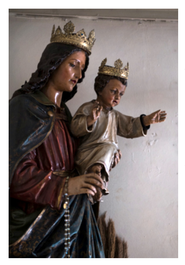
Statue of the Virgin Mary and Child from the St. Joseph's chapel. Photo by Ksenia Trofimova, 2019.

vernacular actions are traditionally shared also by Catholic parishioners. The differences between devotional practices at this stage are visually manifested in the discontinuity between dynamic movement and static rest during the performance, as well as in the recited formulas and prayers.