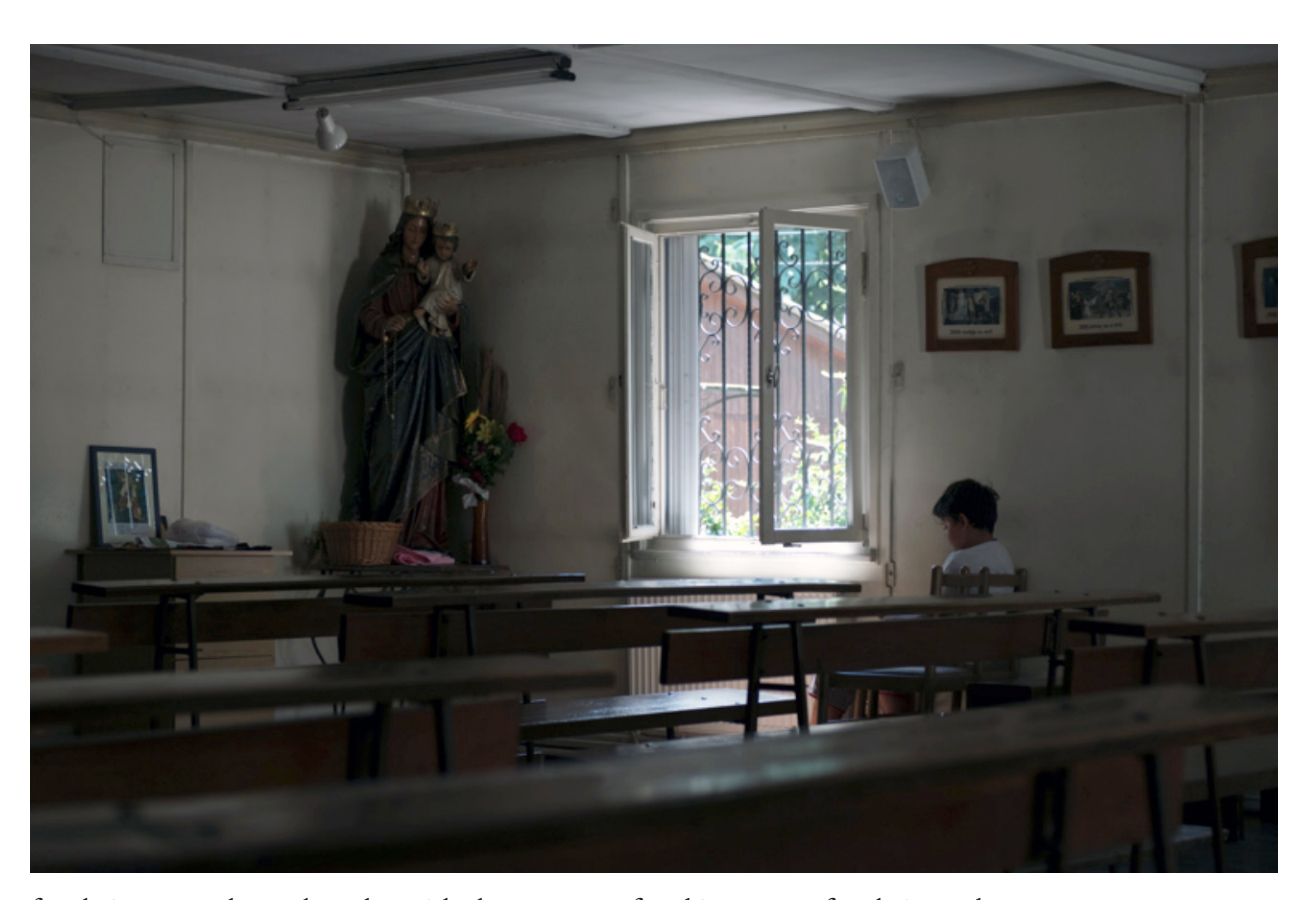
for their personal vow, but also with the purpose of making a vow for their weak Waiting for pilgrims. relatives or neighbors.