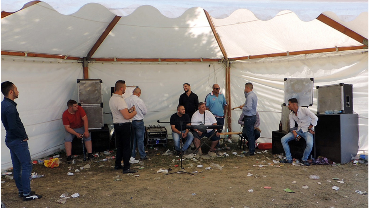
Bands set up in different tents on the hilltop. The party lasts until Sunday morning. Photo by István Povedák, 2017.

emptying of the ritual. We are already experiencing a partially “meaning-lost” rites today, where the void caused by the disappearance of the weddings and the voivode elections was filled by the celebration of the collective Roma identity and togetherness. In the celebrating crowd, several Roma people wished “good luck, love, health, happiness, the blessing of the Virgin Mary to all Gypsies” sensitively and loudly, emphasizing with shouting.