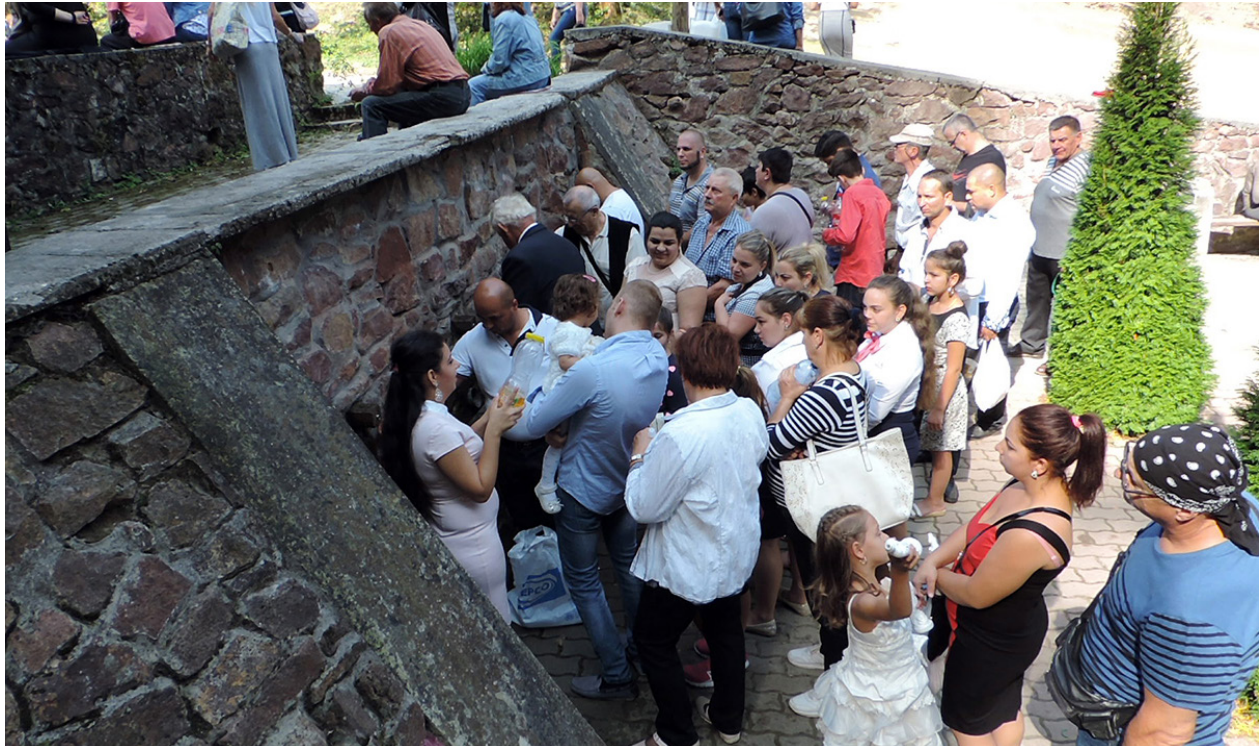
Visiting the holy well is one of the main motivations for pilgrims to Csatka.

children’s face and eyes with the water, and refill their bottles. In fact, visiting the Virgin Mary and taking in the water of the holy well are the two main motivations—of a religious nature—among the Roma pilgrims. As a 47-year-old man from Komárom, Slovakia said, “The first thing we did was come down to the well. We dedicate ourselves first. We apologize to Saint Mary and our dear Holy God. We consecrate the house at home and everything else. Car, house, ourselves.” Similarly, a 54-year-old man from Győr mentioned: “There is water in the car here as well.” And what do you do with that? “I consecrate the house, the children, my grandchildren, I wish good luck to my house, all which is inside, and if something bad hits the house, I sweep it all with it.”