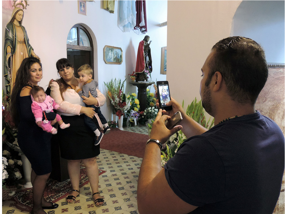
Pilgrims pose for pictures before the Virgin in the church in the valley.

The pilgrimage of Csatka to be presented in this study also carries traditional religious and secular ethnic features at the same time, but it acquired its present syncretic form in a different way. The pilgrimage site that appeared at the end of the 19th century—at the time of the apparitions in Lourdes—suddenly became popular in Hungary, attracting Hungarians, Slovaks, Germans and Roma at the same time. As a result of the historical changes, first the Slovaks and then the Germans disappeared, and by today, the always quiet and abandoned forest chapel of Csatka, a previously multi-ethnic pilgrimage site, becomes the “capital” of the Roma once a year. Roma come from all parts of Hungary, but also from Slovakia and Transylvania to the “Virgin Mary of Csatka,” to the—as often referred by pilgrims—“Gypsy Csíksomlyó,” in order to drink from the miraculous water of the forest spring, to wash their faces in the water, or to take some home for those who were not able to come. 13 While the social influence of the Catholic Church in Hungary has been gradually weakening since the communist takeover in 1947 with a steady decline in Mass attendance and the number of those who profess to be religious, the