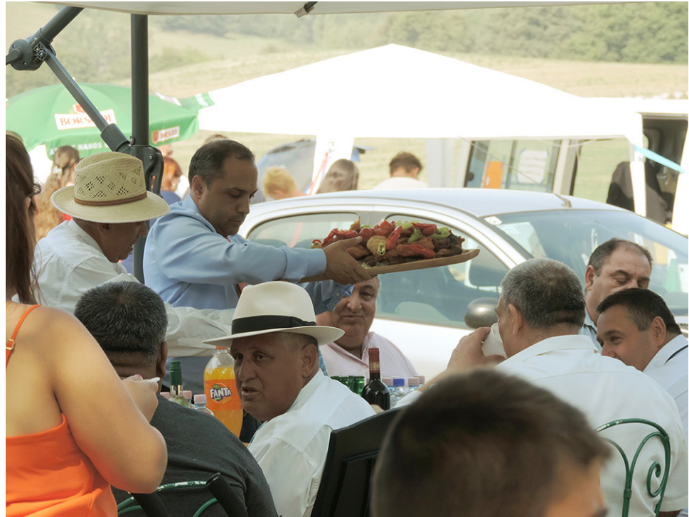
A table reserved for voivodes (Roma political leaders).