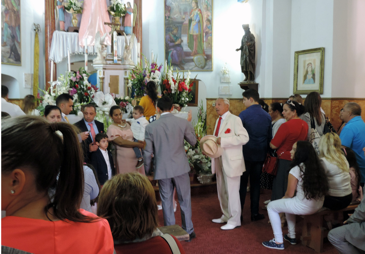
A well-dressed family poses for photos in the church.