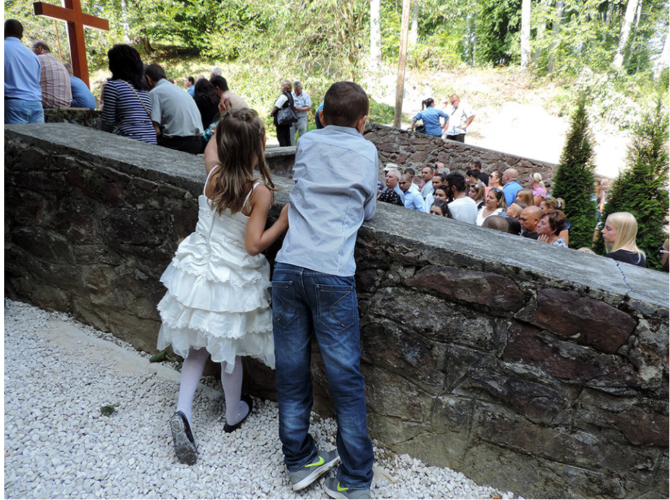
Children overlook the area of the holy well at Csatka.

and secular (communal, identity-strengthening, entertaining) part in both place, the nature of rites, and ritual actions. However, the main motivation for participating in the pilgrimage is still the religious activities, which in the case of Roma exists in symbiosis with the strengthening of community cohesion. The all-night fun is just an additional—but much – anticipated—element of this. The bipolarity of the site has disturbed and continues to bother mainly Gadjo pilgrims and clerics to this day while it has an identity-strengthening role for the Roma.