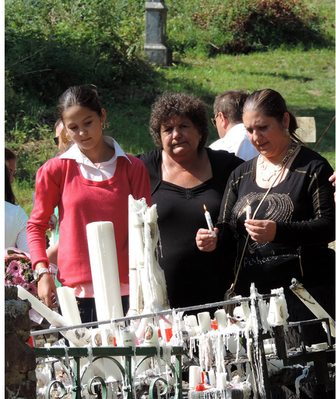
Pilgrims buy candles to light in front of the chapel. Photos by István Povedák, 2017.

the cross from a Roma man. 33 The inscription in Lovari is “ Szuntona Dévla Zsutin E Romen ” (Holy God, help the Roma). The Roma pilgrims who come here light the candles—an obligatory supply—here in front of the chapel. Each member of the family also lights one or more candles. Children light a smaller, adults a larger candle often weighing several pounds and one and a half meters high. As a result, the melted wax from the constantly growing candles flows down the hillside like white lava after a few hours. When they enter the chapel, the first thing they do is photograph the cross and then themselves. The younger ones post the pictures instantly on Facebook and Instagram. Many begin praying spectacularly in front of the “candle forest” around the outdoor statue of the Virgin Mary. Then the next stop is the church in the valley, where the women place new bouquets of flowers and vases in front of the altar, throw money in the moneybox, and then take family photos. Many of them start petitioning the Virgin Mary: “What I really like is that Gypsies always kneel in front of the altar and pray to it in Gypsy language and it’s so beautiful. They take the little children down to sanctify, to bless [the Virgin].” (55-year-old-woman, Zalaegerszeg)