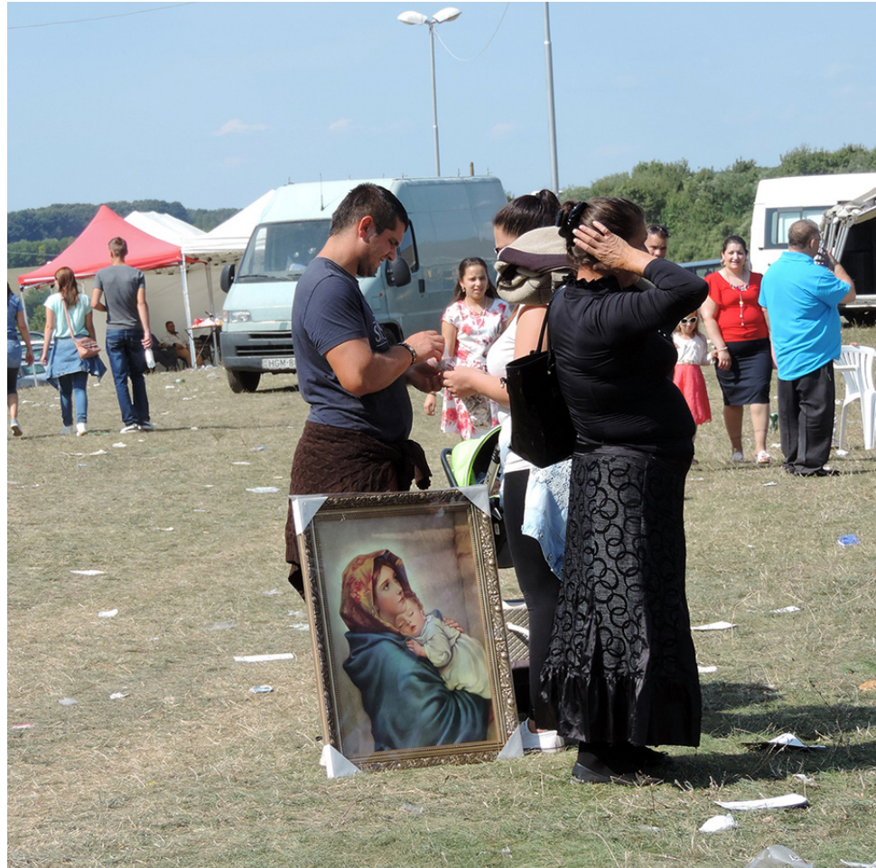
Shopping and spending money is part of the Roma experience.

now gift. As the giver expects the statue to be dressed in the clothes they donated, the statue must be redressed several times during the pilgrimage. In addition to material gifts, money thrown into the moneybox is also a status symbol, although one of the organizers reported a decrease. As he said, “They spend more now at the vendors up there than below at the church. There is a lot less money now, but that was not the case in the past.” (50-year-old-man, Pápa) Others said that there was a family that had a crown made for the statue: “This statue of Mary, this shrine, the chapel were also built by the Gypsies, I know that, and the statue also has many gold jewels that the Gypsies made for her, she also has a golden crown.” (41-year-old-woman, Szombathely)