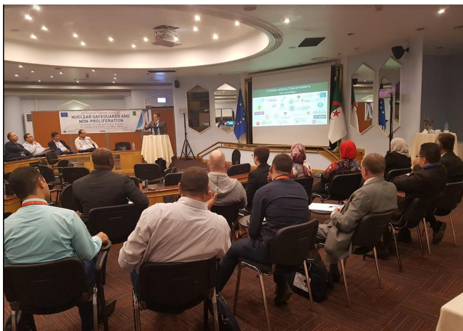
Figure 5: A lecture session of the ESARDA Course in Algiers, October 2018.