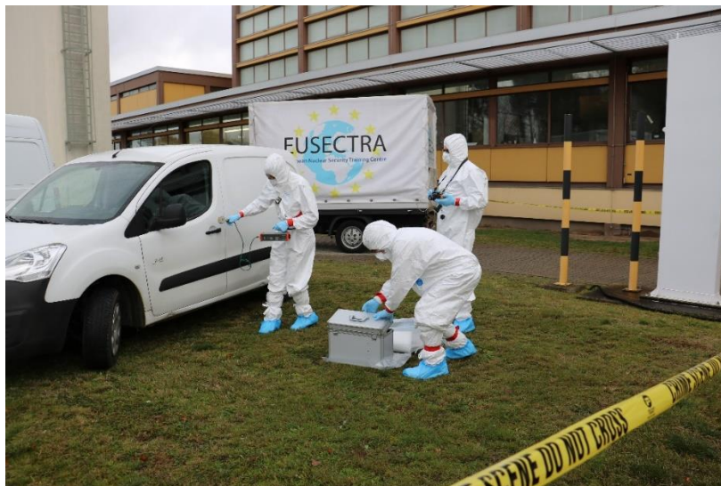
Figure 1: Outdoor facility of EUSECTRA with trucks & vans able to transport (and hide, for training purposes) real fissile materials. This picture was taken during a Radiological Crime Scene Management Training.

EUSECTRA represents a substantive, enduring, and sustained new core activity at JRC and positions nuclear security training at the center of its extensive nuclear counterterrorism and nuclear non-proliferation portfolio. This initiative outlines the integration of the different modules into a coherent and comprehensive set of training courses covering both detection and response strands. Training areas for EUSECTRA include border detection, mobile detection, covert search, train-the-trainers, Mobile Experts Support Team (i.e., Mobile Expert Support Team [MEST]), reach-back, creation of national response plans, nuclear forensics, radiological crime scene management, nuclear security awareness, and sustainability of a national nuclear security posture. In the specific area of nuclear forensics, highlight trainings includes, but is not limited to, Awareness Workshop, Applications of Existing Capabilities to a Nuclear Forensics Investigation, advanced gamma spectroscopy, and dedicated technique and instrumentation hand-on trainings (e.g. Inductively Coupled Plasma-Mass Spectrometry, Scanning Electron Microscopy, etc.) [3].