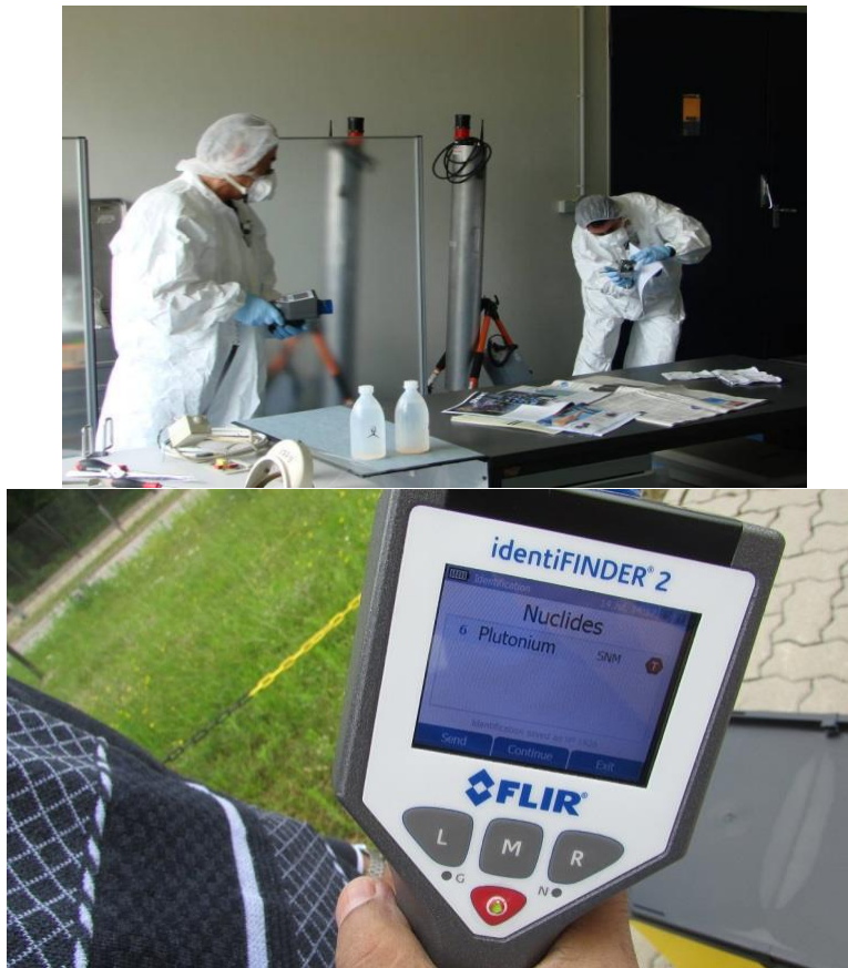
Figure 2: tabletop and in-field exercises to both find nuclear materials and implement a proper radiological crime scene management.

In the law enforcement context, a most-requested training is on Radiological Crime Scene Management (RCSM). Radiological crime scene management is the process used to ensure safe, secure, effective, and efficient operations at a crime scene where nuclear or other radioactive materials are known or suspected to be present. The training aims at bridging law enforcement procedures, radiation protection needs, and nuclear measurement expertise in processing such a particular crime scene. Self-protection, evidence collection, evidence management, chain of custody, contamination control, initial identification of the radionuclides, and radiological assessment are the primary topics of this one-week course [4]. These concepts are to be practiced on numerous realistic scenarios in table-top and, most importantly, in hands-on exercises (see Figure 2).