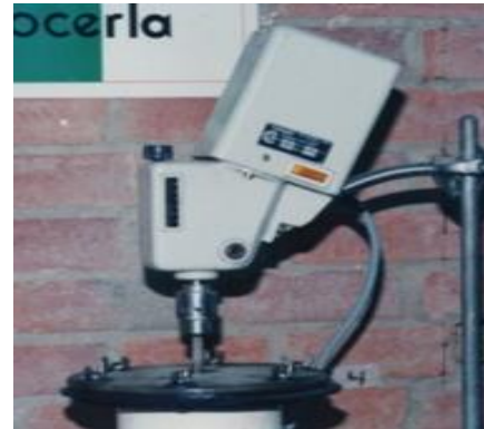
Fig 2. Rotation system slow

sediment present some kind of disturbance, see figure 2.