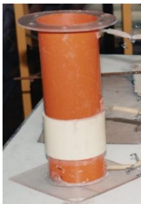
Fig 1. Aerobics column.

This column presents a constant supply of air through a pump connected to an access valve located in the lid, the air is induced when liquid medium through a diffuser, avoiding any kind of disturbance in the sediments. This column is transparent allowing the passage of light, facilitating the activity of some algae, see figure 1.