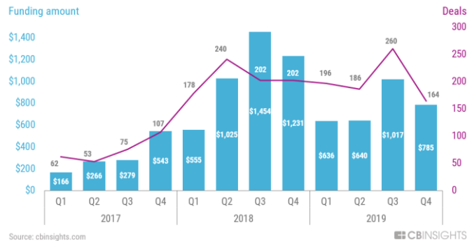
Figure 3. Funding of blockchain in time

The question of security with regard to tokens as a financial investment instrument has essentially the same issues as any other risky asset. All securities have varying levels of risk, like tokens. The problem of token jurisdiction is similar to the regulation of ordinary securities. Some countries monitor cryptocurrency and token transactions with higher scrutiny (USA, Switzerland), but many countries allow you to make money without detailed checks on investors and their projects (Japan, the Netherlands), and in some countries cryptocurrencies are prohibited entirely (China, Republic of Korea). As described in the paper, the experience of ICO in the USA shows that cryptoassets and tokens are not prohibited en masse at all levels since they are fully consistent with the basic human right for freedom of enterprise. Yes, fraud and manipulation are possible on the cryptocurrency and token market (especially when it comes to utility tokens); this market does not prevent money laundering and criminal investor transactions. However, the experience of the American SEC shows that the fight against fraud and money laundering in the field of IT is no different from the typical procedures used on the securities and investment market. Thus, we can conclude that, in principle, it is possible to regulate the cryptoassets market and prosecute violators.