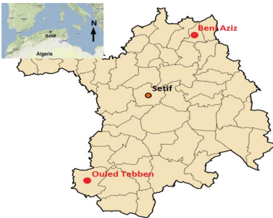
Figure 1: Location map of the study area and sampling sites.

Our study concerns the Algerian North-East region (Setif). two areas were chosen to translate continentality gradient in the region. Beni Aziz is the first area located in north. [36° 28'N 5° 39'E], in the bioclimatical sub-humid with warm winter (precipitation of 700 mm / year), the second area is Ouled Tebben in the South [35° 48'N 5° 06' E], is located in the semi-arid with temperate winter (precipitation of 350 mm / year).