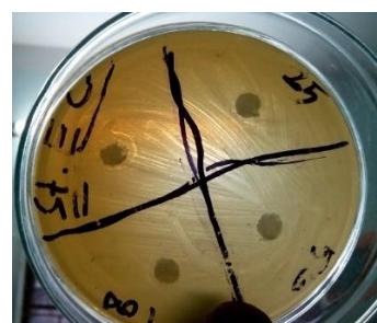
Figure 1: Bacillus subtilis