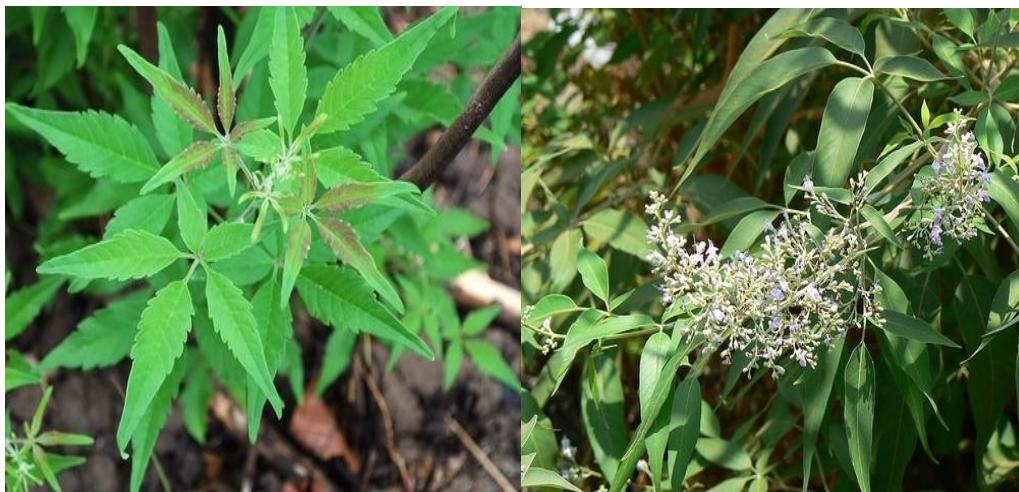
Figure 1: Vitex negundo leaves