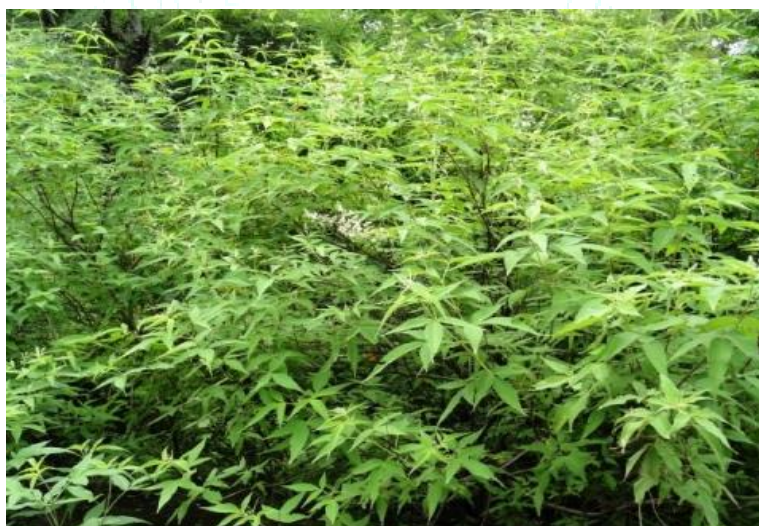
Figure 2: Whole Plant of Vitex negundo

1.3 long), lanceolate, hairy beneath and both the ends are pointed. 6 The flowers are numerous which are bluish purple in colour and in branched in tomatoes cymes and the fruits are round, succulent and black on ripening with four seeds. 7