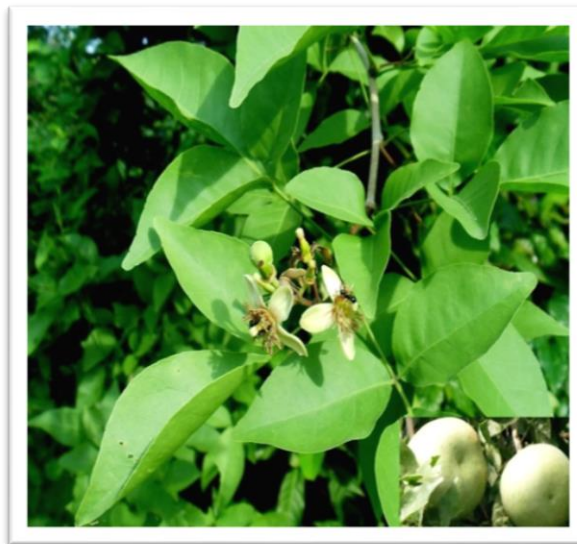
7. Aegle marmelos