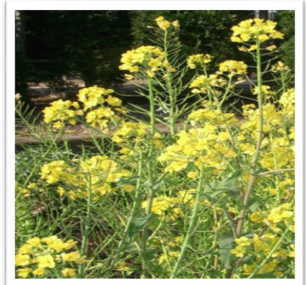
15. Brassica rapa