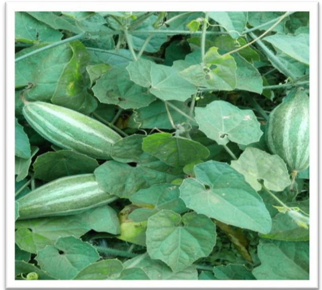
13. Trichosanthes dioica