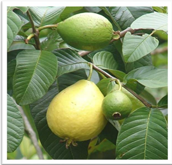
10. Psidium guajava