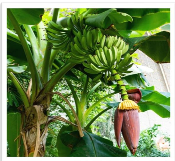
5. Musa paradisiaca