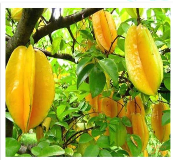
6. Averrhoa carambola