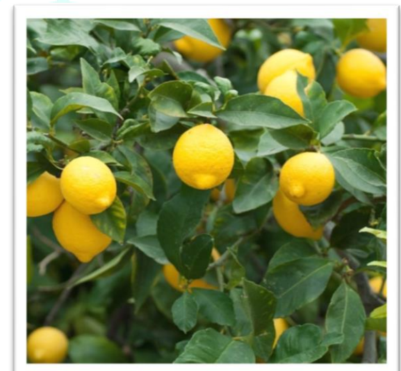
9. Citrus limonum