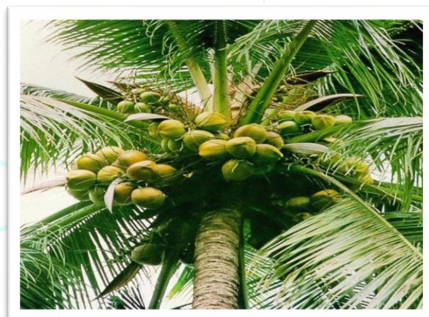
2. Cocos nucifera