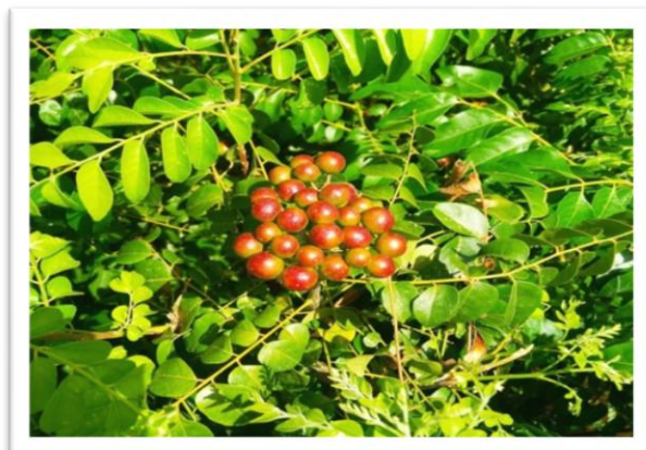
3. Murraya koenigii