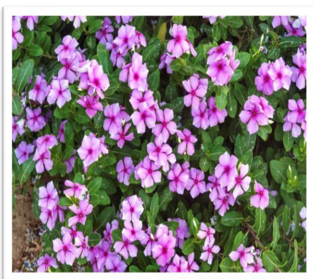
12. Catharanthus roseus