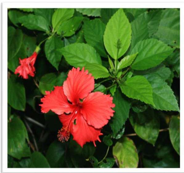
11. Hibiscus rosa sinensis