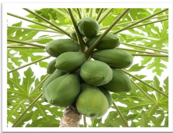
1. Carica papaya

The author would like to extend the heartfelt gratitude to the respected person and their esteemed institutions for their extensive support to complete the extensive review.