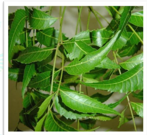
8. Azadirachta indica