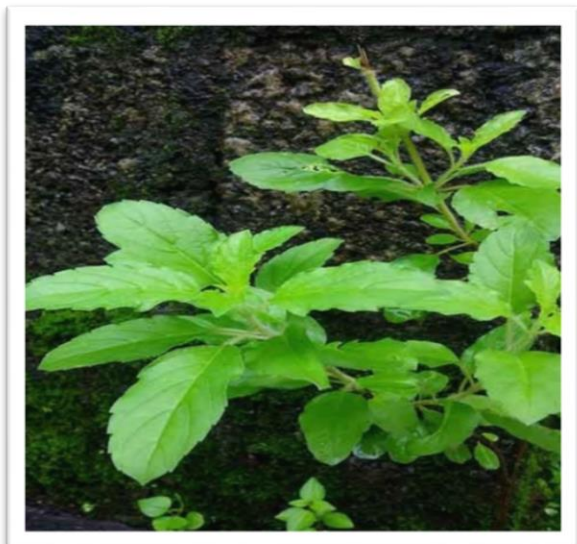
4. Ocimum sanctum