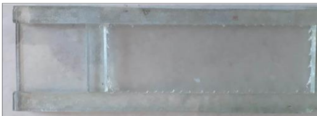
Figure 1: Preparation of fast dissolving oral films