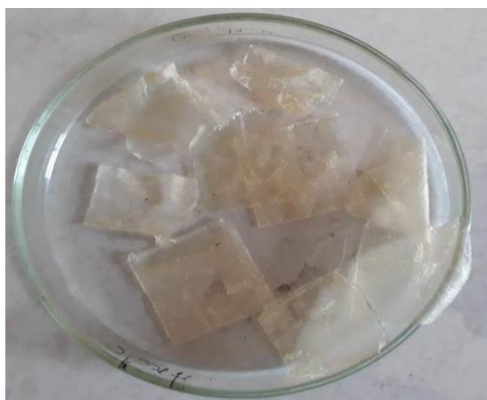
Figure 2: Prepared fast dissolving oral film