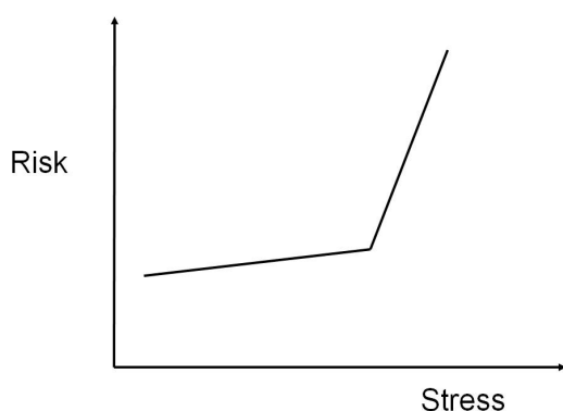
Fig. 2: Relationship between system stress and risk, holding system coping capacity constant

Increasing interconnectedness is evident in today's globalised world. Greater (and faster) connectivity is appealing, because it can boost communication, economic production and societal innovation. The connectivity of social systems allows people to exchange experiences and knowledge on an international scale, which can act as an important attenuator of risk. However, as systems become more interdependent, faster and more complex, they may also become more tightly-coupled, where the links between the components in the system are very short, meaning that each component can have an almost immediate and major impact on one or more other components in the system (see Perrow 1999). This tight coupling is synonymous with a loss of safety margins in a system, which leaves the system more vulnerable to surprises – even a small mechanical failure or accident can have grave consequences, perhaps even leading to a system breakdown (Homer-Dixon 2006).