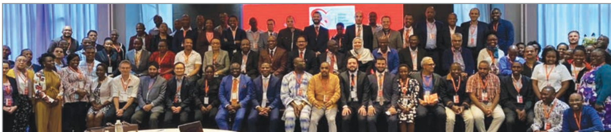
Delegates attending the first African Heart Rhythm Association (AFHRA) meeting in Nairobi, Kenya in January 2020.