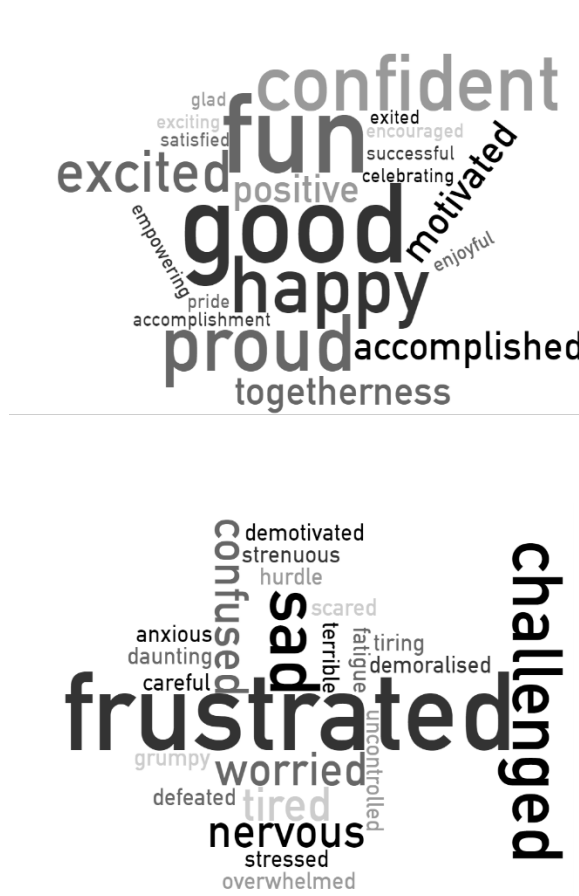
Figure 2: Positive and negative words associated with the DNA bench challenge.

The emotions linked to the challenge showed a wide scope of feelings. After identifying the challenge, some students used words like “frustrated”, “worried”, “stressed”, “nervous” and “feeling like giving up”; but others used words such as “emotional”, “excited”, “positive and up for the challenge”, “motivated” and “empowering”. After solving the challenge, the students expressed their feelings with the words “proud”, “accomplished” and “happy that we succeeded”. See the word clouds in Figure 2 for more identified words.