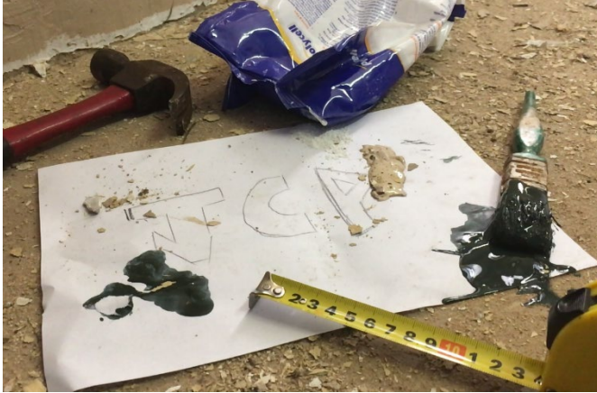
Photograph 1: Code of module written on a paper.

photographs taken did not reflect the challenge. For example, one group stated "... we painted the JCP emblem on 3 bins" and another group submitted a photograph with the code of the module as a challenge (see Photograph 1). Finally, we interpreted the photographs, where we closely examined each photograph, probing the context and meanings of individual images.