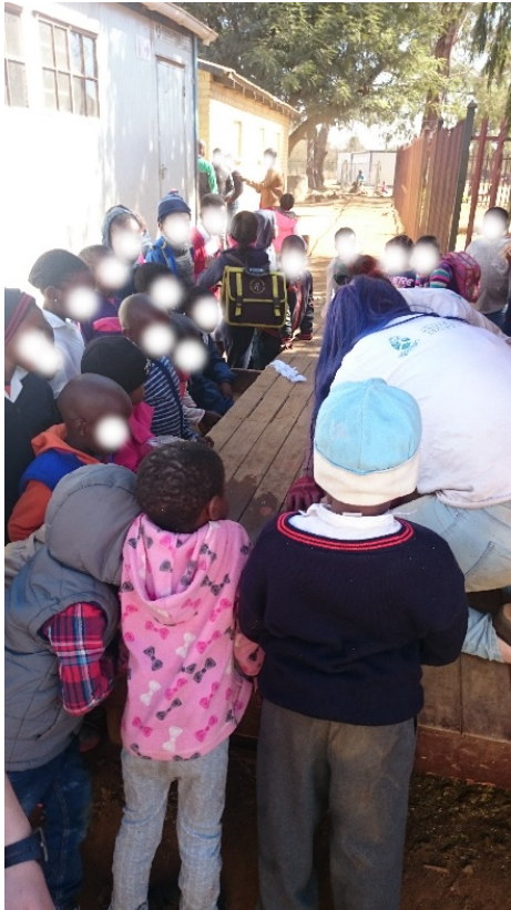
Photograph 8: Repairing benches at a pre-school while learners watch them.

In relation to Photograph 9, the students said that it was heartbreaking to work at a cat sanctuary because so many cats had been abused before they came to the sanctuary. The students took a picture of a happy cat as the organisation did not allow them to take pictures of the abused cats.