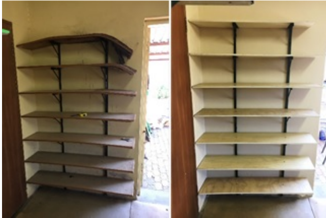
Photograph 10: The shelf before and after the students repaired it.

Photograph 10 showed the before-and-after photograph of one of the shelves they had to repair at one of the non-profit organisations.