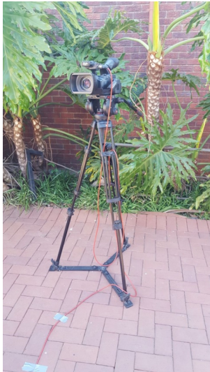
Photograph 3: Some of the equipment used

“Repairing cracks/holes was not what we thought we would encounter. We only thought of painting. So as a team, we had to come up with a way to repair without using cement because cement is much expensive and requires some skills to work with it.”