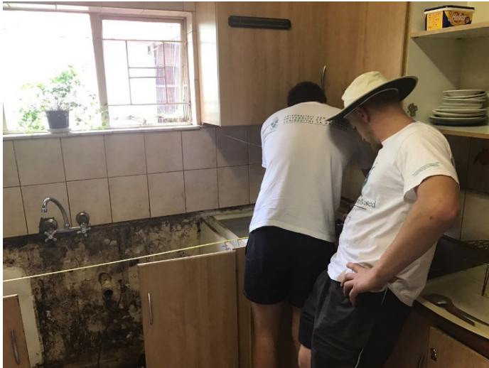
Photograph 5: Removing the top of the basin.

In photograph 5 the students stated that they had encountered a problem with removing the top of the basin at a non-profit organisation. The basin had to be removed as it was loose. The wooden cabinet had rotted around the basin and was, therefore, a safety risk for the residents.