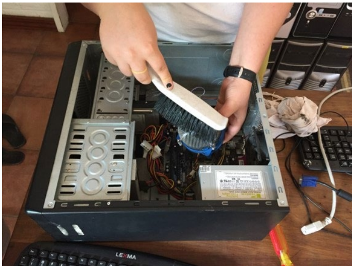
Photograph 6: Cleaning dust from the old computers

In their narrative about photograph 6, the students said they had to clean the dust from the old computers so that they would be functional again.