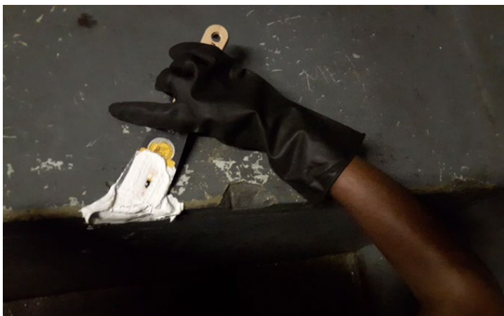
Photograph 4: Filling the holes in a wall with polyfilla

Photograph 4 illustrates students applying polyfilla to a hole in a wall. They had to find the right tools to do the job correctly, and the students knew what to do and how to do it.