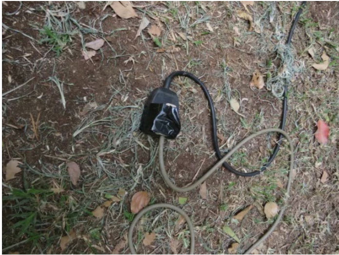
Photograph 7: Ensuring the power cable is safe

The affective theme indicated that students showed some reaction or emotion linked to their challenge. The students were more aware of how privileged they were or that they were emotionally involved with the campus-community partner. A photograph showing the children of the shelter was stated to be a challenge, with the comments: