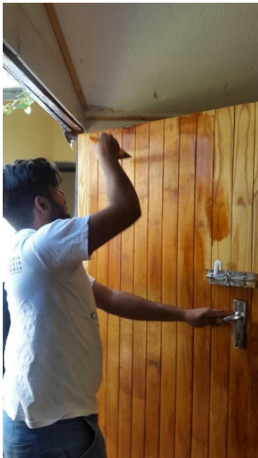
Photograph 2: Installing a door

In photograph 2 the students indicated that they could not manage to fit a door, mainly because they did not have prior knowledge of how to fit it.