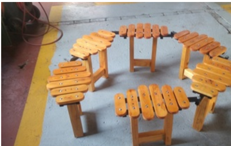
Photograph 11. The DNA bench completed.

Designing and building a wooden bench for a local zoo that requested it should look like a DNA string (Photograph 11) was a huge challenge for a group of Mechanical Engineering students.