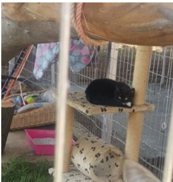
Photograph 9: Cat sanctuary

In relation to Photograph 9, the students said that it was heartbreaking to work at a cat sanctuary because so many cats had been abused before they came to the sanctuary. The students took a picture of a happy cat as the organisation did not allow them to take pictures of the abused cats.