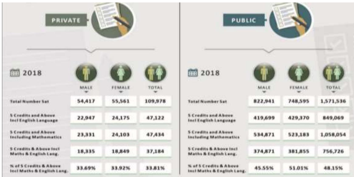
Figure 1. WAEC Results Statistics 2018 For Nigeria: Result Statistics for 5 Credits Including English Language only, Including Mathematics only and both Mathematics and English language.

Source: National Bureau of Statistics (NBS): WAEC RESULTS STATISTICS 2018