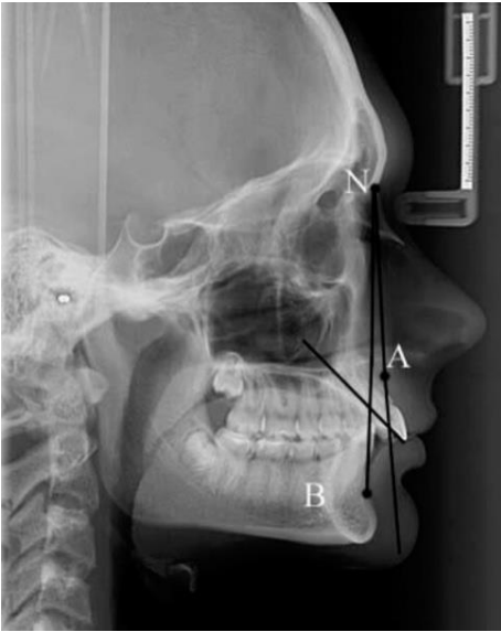
Figure 5. The cephalometric ANB angle and the angle of inclination of upper incisors.