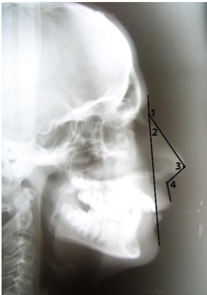
Figure 7. Angular parameters: 1. Nasofrontal angle (G-N-Nd); 2. Nasofacial angle (Prn-N-Pg); 3. Nasal tip angle (N-Prn-Cm); 4. Nasolabial angle (Cm-Sn-Ls).