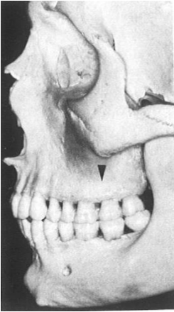
Figure 1. Skull with Class I dentoskeletal pattern [Source 26].