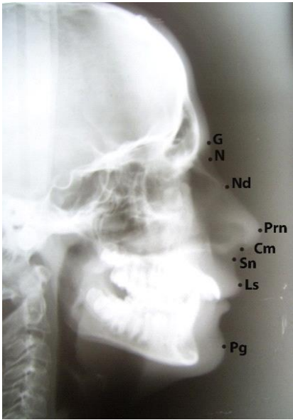
Figure 6. The landmarks used in this investigation: glabella (G), nasion (N), nasal dorsum (Nd), pronasale (Prn), columella (Cm), subnasale (Sn), labiale superior (Ls), pogonion (Pg).