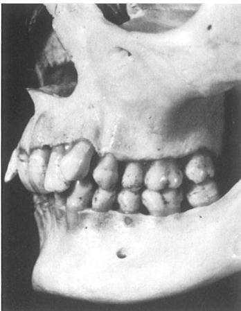
Figure 3. Skull with Class II division 2. dentoskeletal pattern [Source 26]