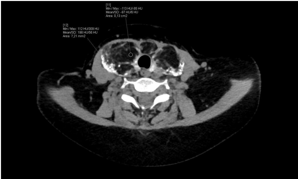
Figure 3. A CT scan of the neck with reconstruction of the thyroid and volumetric analysis of the lobes