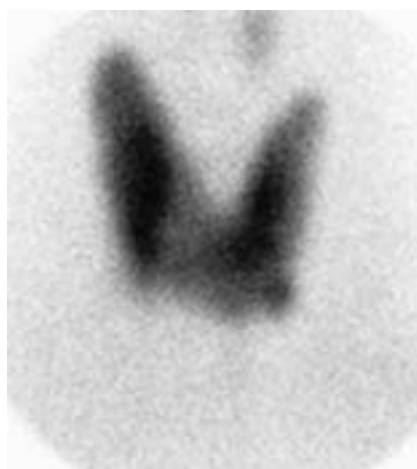
Figure 2. Sestamibi parathyroid scan showing an accumulation of the tracer in the same localization of Tc-99m focal uptake