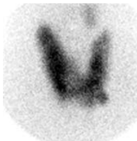
Figure 1. Tc-99m scintigraphy showing one focal uptake below the left lobe of thyroid

same localization of Tc-99m focal uptake. It was a dilemma: is it an eccentric thyroid tissue that fixes the two radiotracers or a parathyroid adenoma fixing the ^{99m}\text{Tc} . Since we do not have the iodine 123 we realized an image (Fig. 3) with a tracer dose of iodine 131 showing no uptake below the left lobe of thyroid which allowed us to conclude to a parathyroid adenoma. The patient subsequently underwent minimally invasive cervicotomy with the resection of this lesion which was histologically diagnosed as a parathyroid adenoma.