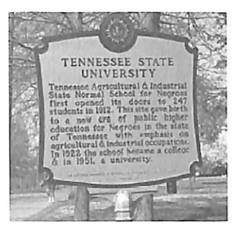
Historical Marker commemorating the establishment of Tennessee State University

Tennessee State University is a comprehensive urban coeducational land-grant university founded in 1912 in Nashville, Tenn. The 450-acre main campus, with more than 65 buildings, is located in a residential setting; the Avon Williams Campus is located downtown, near the center of the Nashville business and government district.