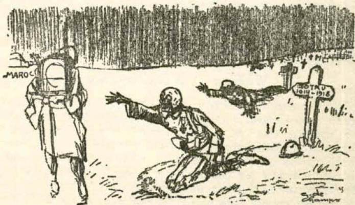
L'Humanité , September 14, 1925