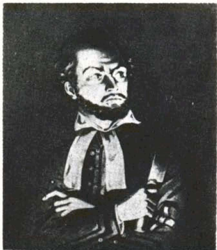
Edmund Kean as Shylock

Then Shylock tells the audience he is out to "get" Antonio: