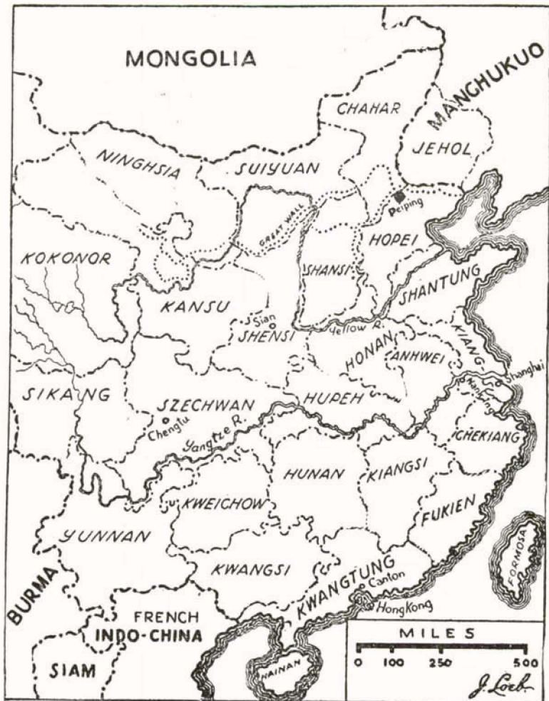
A MAP OF CHINA