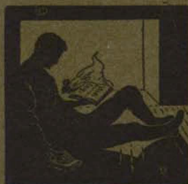
Abraham Lincoln studied by firelight

Staff Tutor, London District Workers' Educational Association of Great Britain