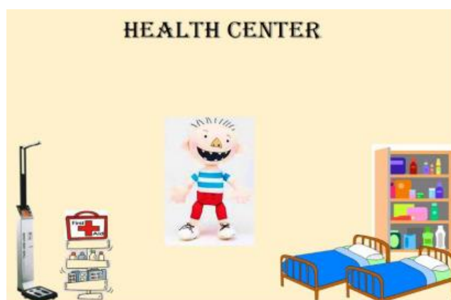
PowerPoint Slide on Health Center

As for the topic “Food,” Amy wrote the following scenario as the context in her lesson plan as follows: