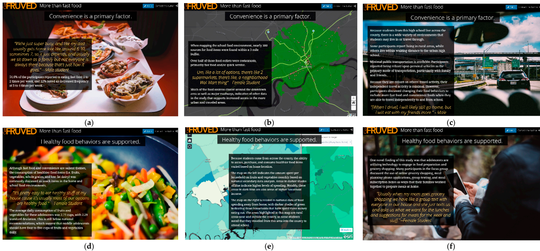
Figure 2. Pictorial depiction of online, interactive story map as follows: (a) Start of convenience section where fast food is depicted for family meals and embedded quote from focus groups; (b) next convenience section where school food environment with buffer zone and identified food outlets are shown; (c) transportation shown with narrative regarding dependent travel activity and embedded quotes from focus groups; (d) the next section depicting support of healthy behaviors starts with cooking skills; (e) mapping of county region from Prong 1; (f) use of technology with meal planning and preparation shown.