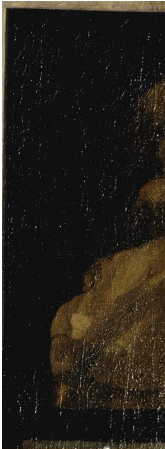
Detail from The Music Lesson