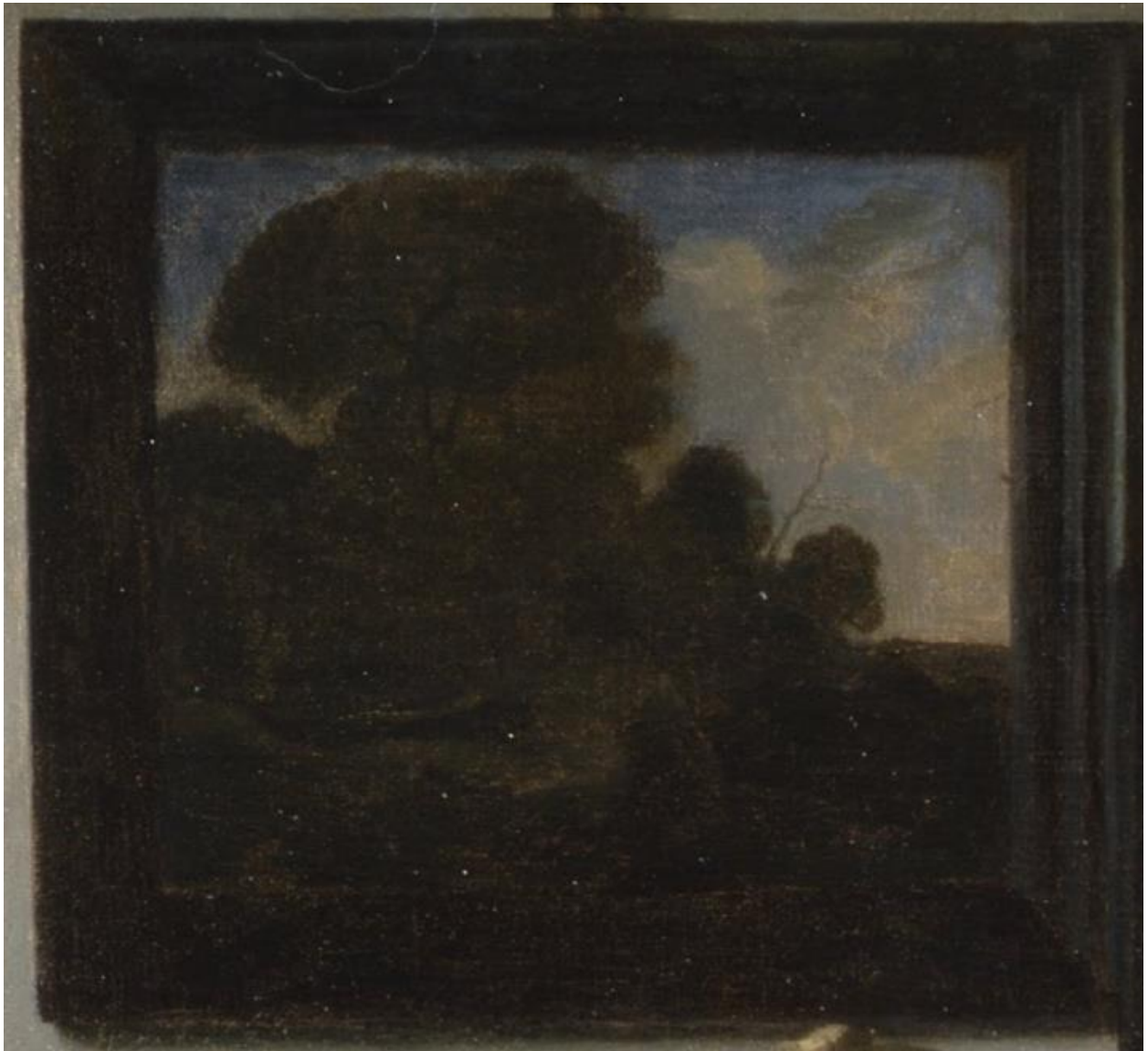
Detail from The Concert