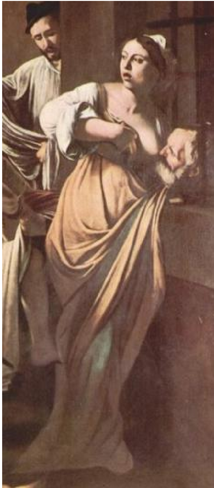
Detail from The Seven Works of Mercy