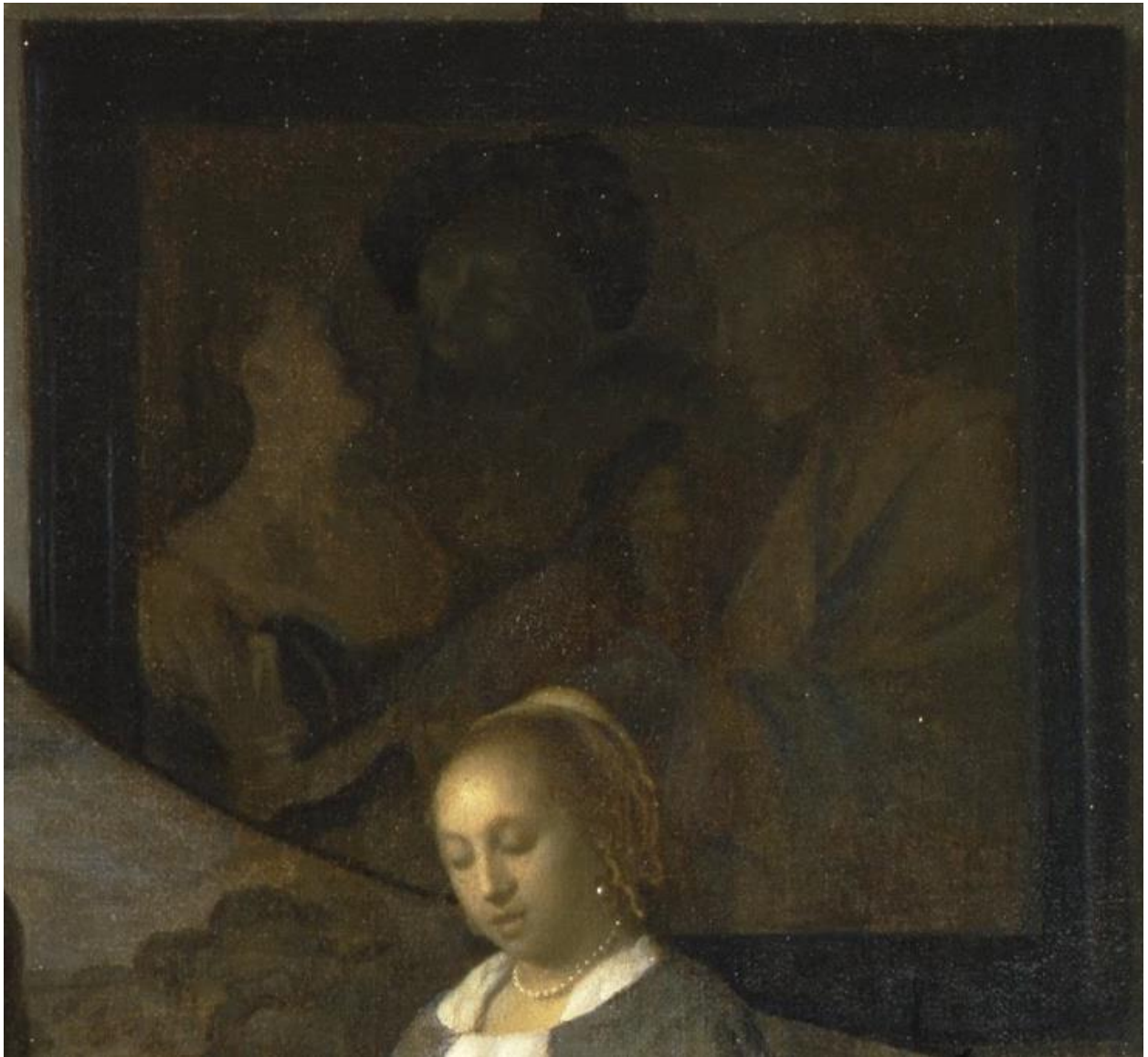
Detail from The Concert