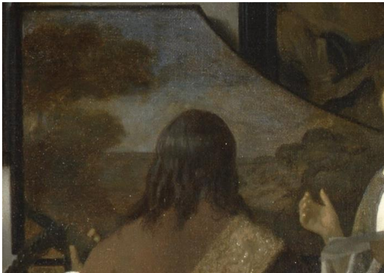
Detail from The Concert