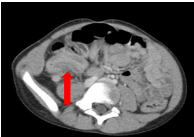
Fig. 2. Red arrow: The terminal ileum with intussusception.

Our case describes a patient presenting with intussusception and an extensive gastrointestinal and pulmonary history. These clinical findings lead to the diagnosis of cystic fibrosis. The