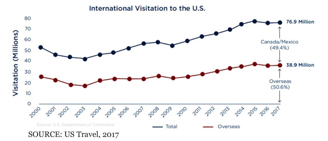
FIGURE 2 – INTERNATIONAL VISITATION TO THE US

Most overseas travel to the U.S. originates in relatively few markets. In fact, the top 10 overseas source markets account for 59 percent of all overseas visitors . Though the composition has changed over the years, this high concentration has remained fairly constant and is projected to continue. (US TRAVEL, 2017; our emphasis).