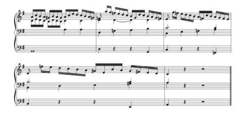
Figure 16 - Prelude in G Major (BWV568), mm. 28-32 (first beat)

Difficulty: Playing all the pedal notes correctly.