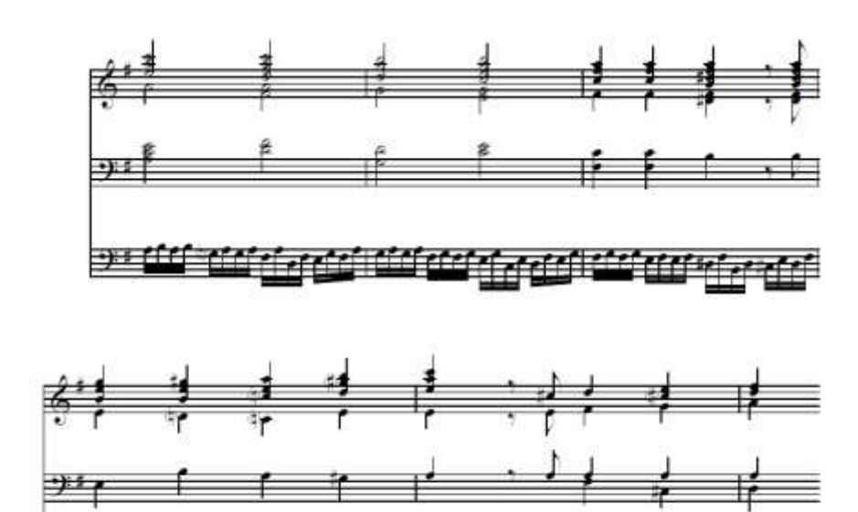
Figure 13 - Prelude in G Major (BWV568), mm. 16-21 (first beat)