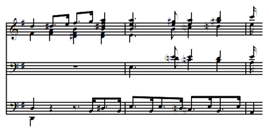
Figure 8 - Prelude in G Major (BWV568), mm. 13-15 (first beat)

Difficulty : chords in both hands and melodic notes in the pedal (homophony x counterpoint):