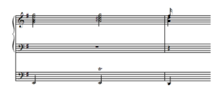
Figure 6 - Prelude in G Major, J.S.Bach (BWV 568), mm. 7-8 (first beat).

d) Play the right hand (R.H.) with pedal (mm. 7-8):