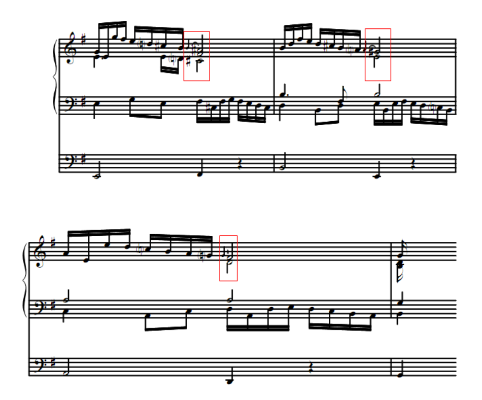
Figure 20 - Prelude in G Major (BWV568), mm. 41-44 (first beat)

6) Technical and Contrapuntal Strategy (mm. 41-44)