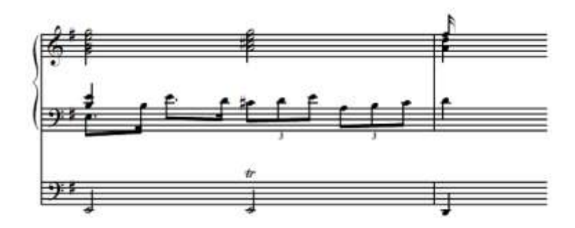
Figure 3 - Prelude in G Major, J.S.Bach (BWV 568), mm. 7-8 (first beat)

Strategies : Five exercises were proposed with increasing difficulty to eliminate this problem: