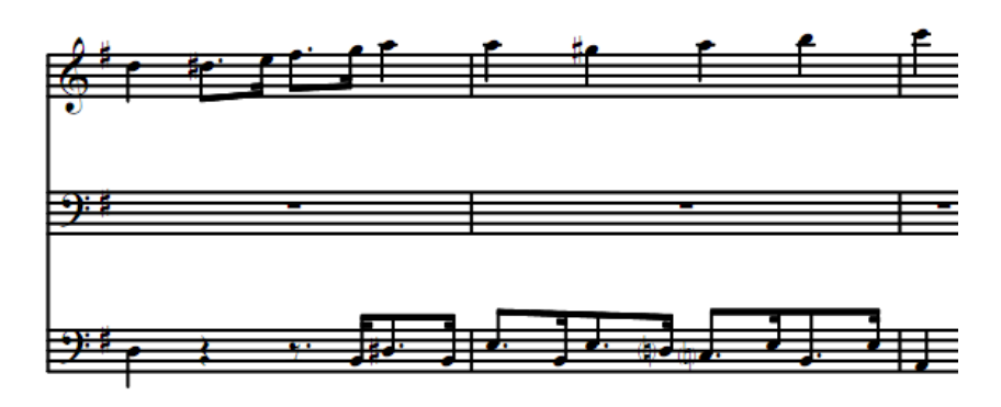
Figure 10 - Prelude in G Major, J.S.Bach (BWV 568), mm. 13-15 (first beat).

b) Now, continue playing the melody with the R.H., but play the pedal with the feet: