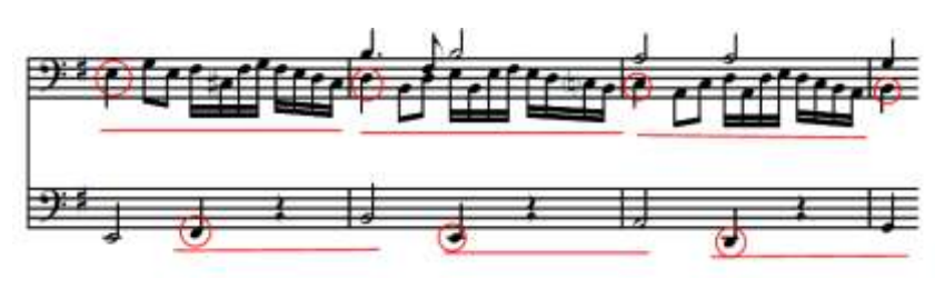
L.H. and pedal

Conclusion: The first strategy introduced (a) was the most helpful and solved the student's problem right away, revealing the student's difficulty as a rhythmic one.