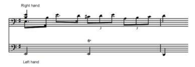
Figure 4 - Prelude in G Major, J.S.Bach (BWV 568), mm. 7-8 (first beat).

Right hand plays the left hand and left hand plays the pedal