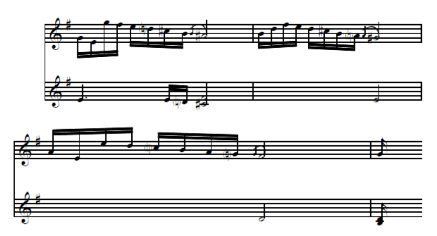
Figure 21 - Prelude in G Major (BWV568), mm. 41-44 (first beat).

Right hand content divided between both hands