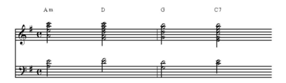
Figure 15 - Prelude in G Major (BWV568), mm. 16-17. Chords in both

c) Play the passage as written: See Figure 13.