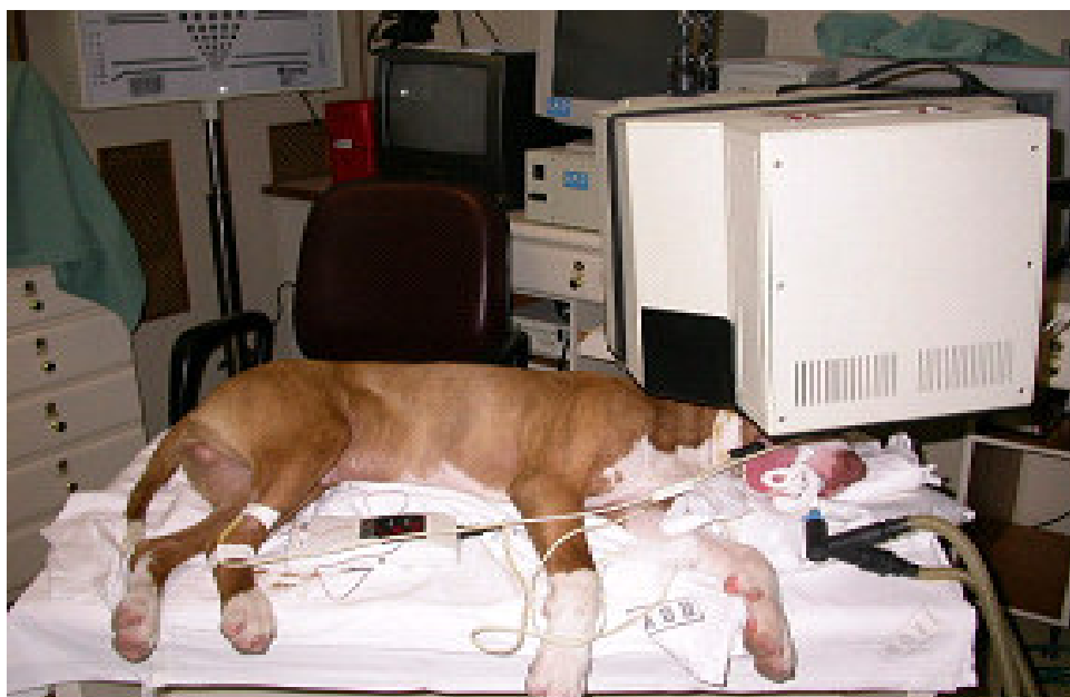
FIGURE 1 – FULL FIELD ERG PROCEDURE IN A PIT BULL DOG.

The animal was withheld of food for eight hours and of liquids for two hours. Tropicamide 1% was used to dilate the pupils and the animal was sedated with acepromazine ( 0.1\text{mg}/\text{kg} ) and pethidine ( 2\text{mg}/\text{kg} ) both intramuscularly. The cephalic vein was cannulated and lactated Ringer's solution administered throughout the entire procedure at an infusion rate of 5\text{ml}\text{kg}^{-1}\text{hour}^{-1} . Twenty minutes after premedication, induction of anesthesia was performed with propofol ( 5\text{mg}\text{kg}^{-1} ) administered IV slowly in a single bolus. Orotracheal intubation was performed and 100% oxygen was offered through a rebreathing circuit of a small animal anesthesia machine and maintenance of anesthesia established with a continuous infusion of propofol ( 0.5\text{mg}\cdot\text{kg}^{-1}\cdot\text{min}^{-1} ). To ensure that the ocular globe would stay centralized, rocuronium ( 0.3\text{mg}\cdot\text{kg}^{-1} ) was administered.