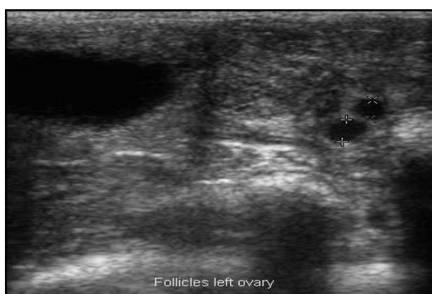
Figure 1 - follicles on left ovary, 15 th day.

A: necessity to empty out the rectum and reinsert the transducer; B: impossibility to perform examination due to rectal edema or gases; C: uterus and bladder visualization; D: ovaries and ovarian structures visualization; E: extra embryonic fluids; F: gravidic sac measurement; G: embryo heartbeat; H: embryo diameter measurement; I: fetal membrane presence; (ne): not evaluated.