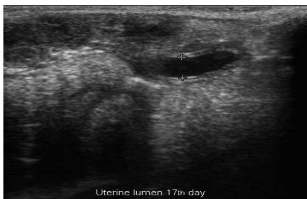
Figure 3 - Uterine extra-embryonic fluid, 17 th day.