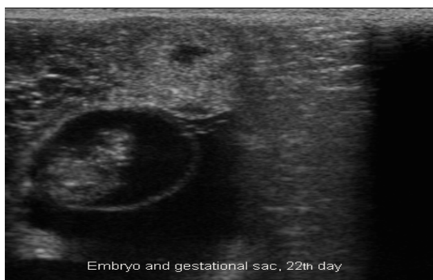
Figure 5 - Embryo and gestational sac visualization. 22 nd day.

pregnant ewe lambs and in 100 % of them by day 21 forward.